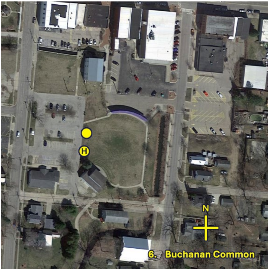
6. Buchanan Common