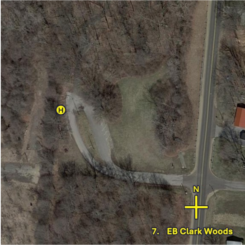
7. EB Clark Woods