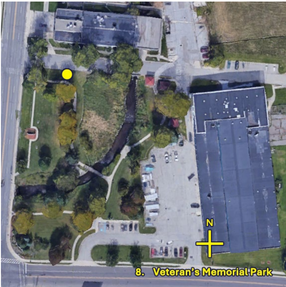
8. Veteran's Memorial Park