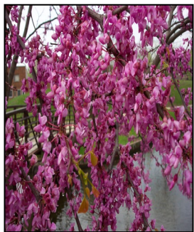
Buchanan, MI Redbud City