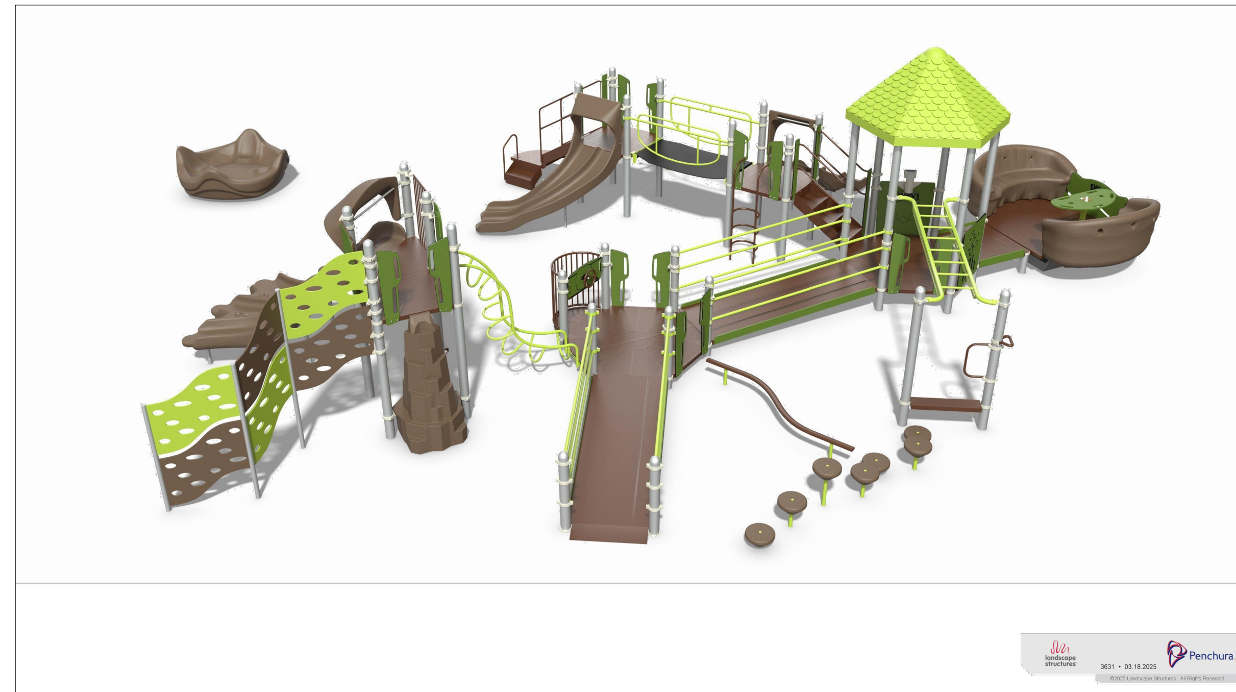
EXAMPLE OF PLAYSTRUCTURE