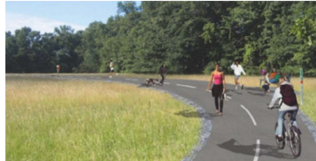
Marquette Greenway Proposed Trail Project