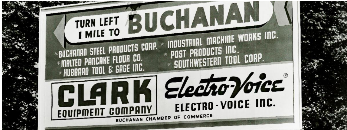
HISTORIC SIGN EXAMPLE