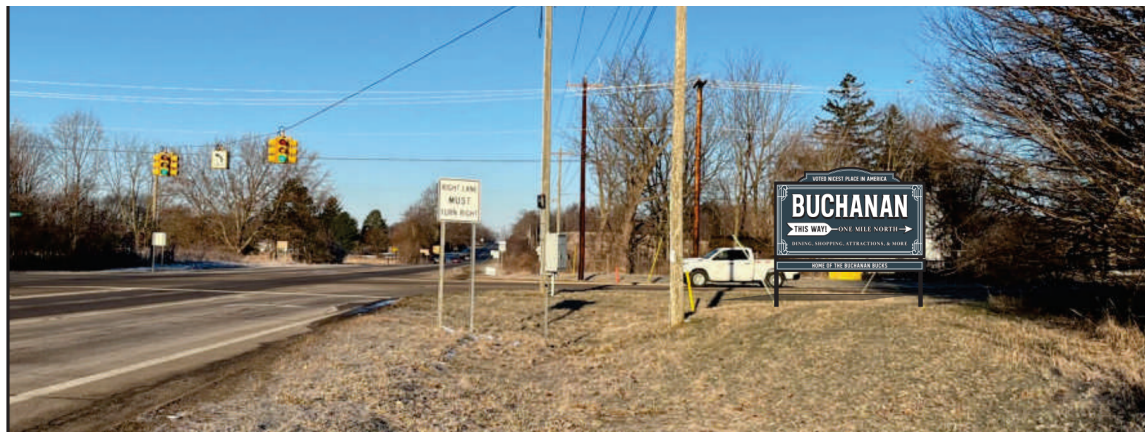
LOCATION OF FUTURE SIGN INTERSECTION OF US 12 AND REDBUD TRAIL