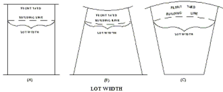
Illustration 14 Lot Width, Area & Depth, Yards