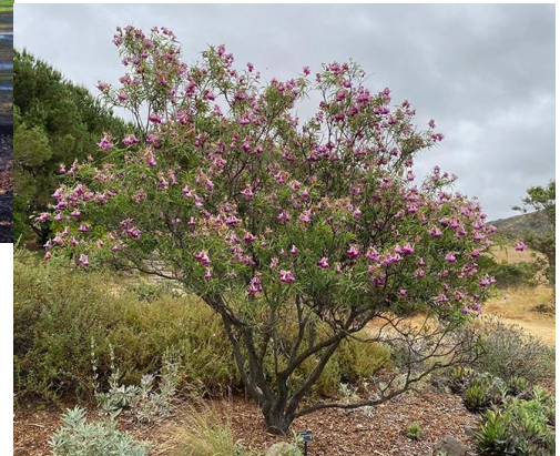
Desert Willow Tree