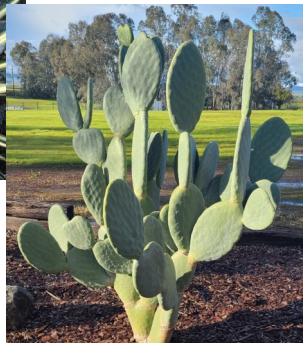
Prickly Pear Cactus