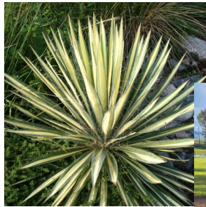
Color Guard Yucca