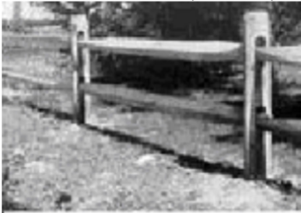
Post and Rail Fence (Split Rail Design)