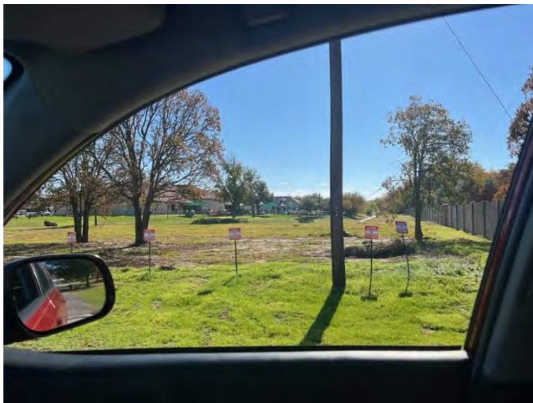
Exhibit A: Site photos dated December 5, 2023