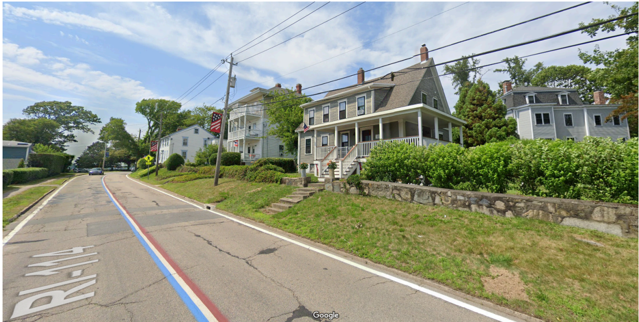
Photo 12 - The House with Street Context Shown Looking East