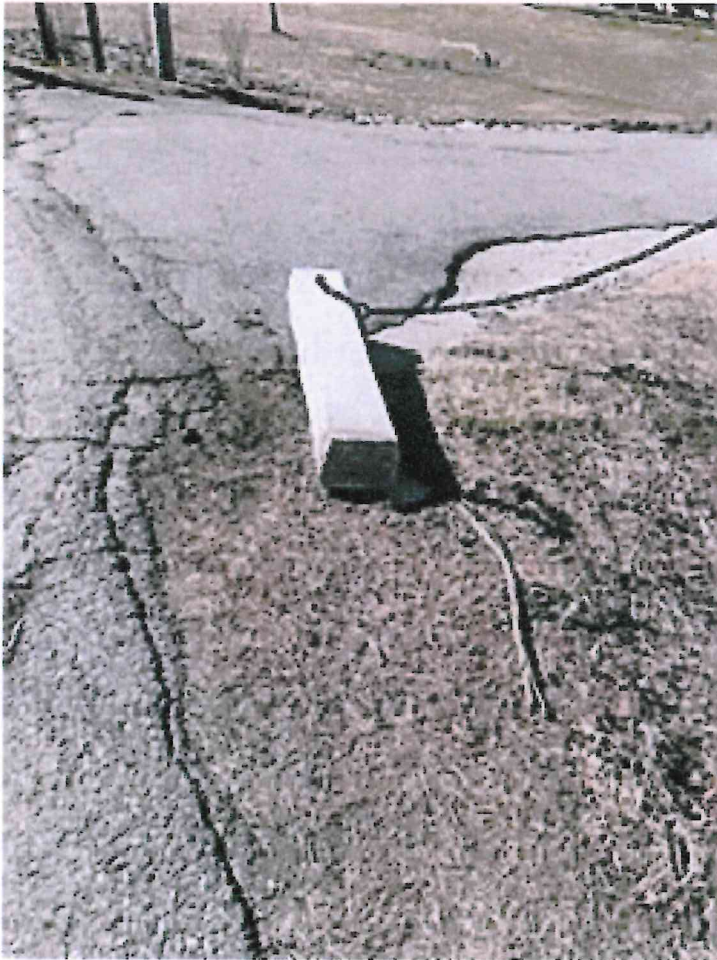
Figure 1: Broken pillar located at parking lot entrance

The Bristol Highlands Improvement Association (Highlands) is seeking compensation for damage at our property at Parcel 69-22, immediately north of 57 Shore Road. Following the 22-23 February blizzard, three granite pillars at the edge of the Highlands property were noticed to be damaged as a result of the Town's exemplary snow removal effort. The pillars mark the eastern edge of the property and are located approximately 14, 22 and 46 feet south of the shoreline Right of Way marker. Two pillars were dislodged and the third was sheared off at the ground. The following photos show the damage to all three pillars.