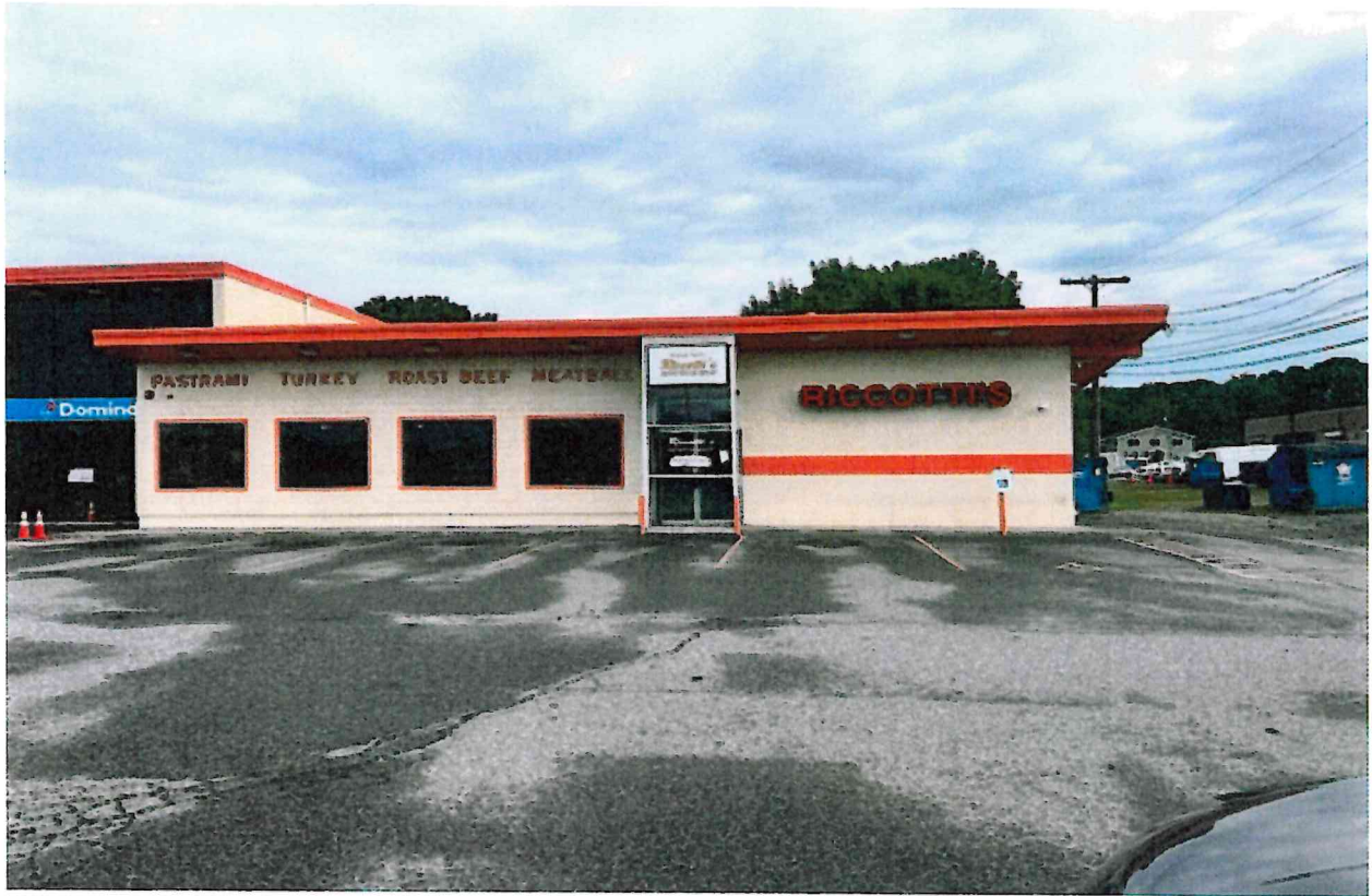
Riccotti's 11 Gooding Ave.