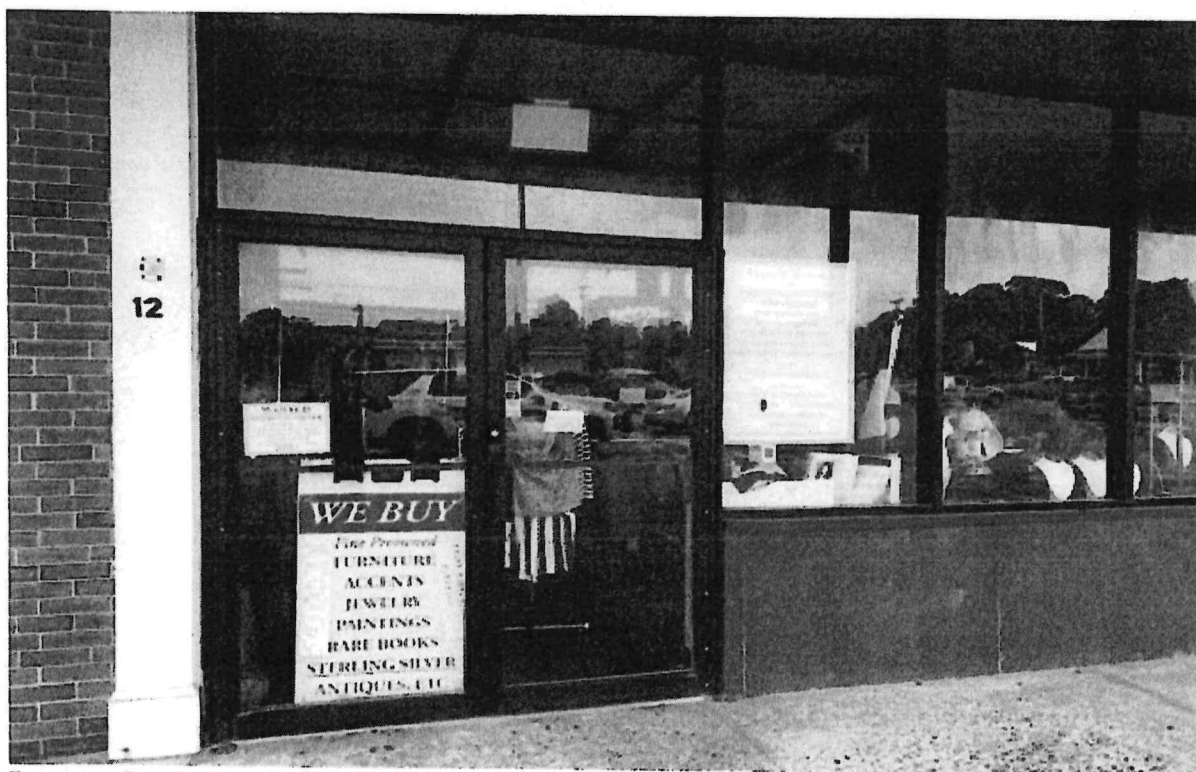
Luxury Goods Etc. 12 Gooding Ave.