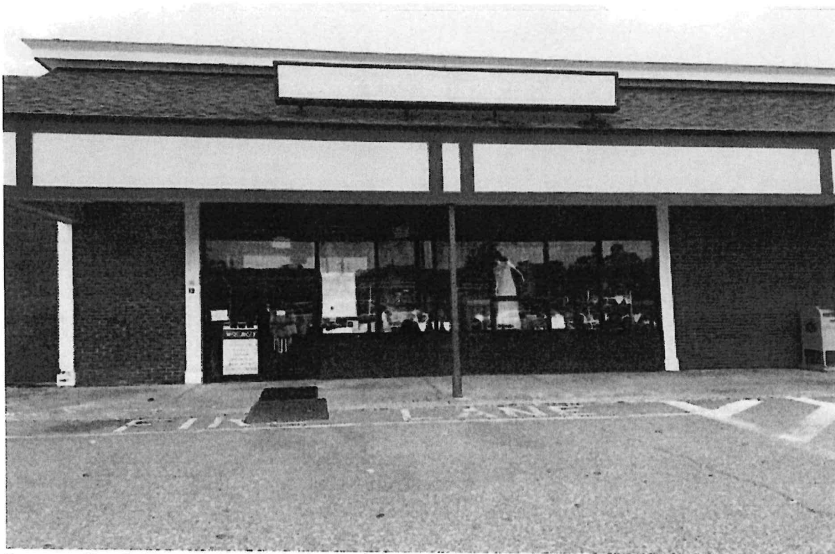
Luxury Goods Etc. 12 Gooding Ave.