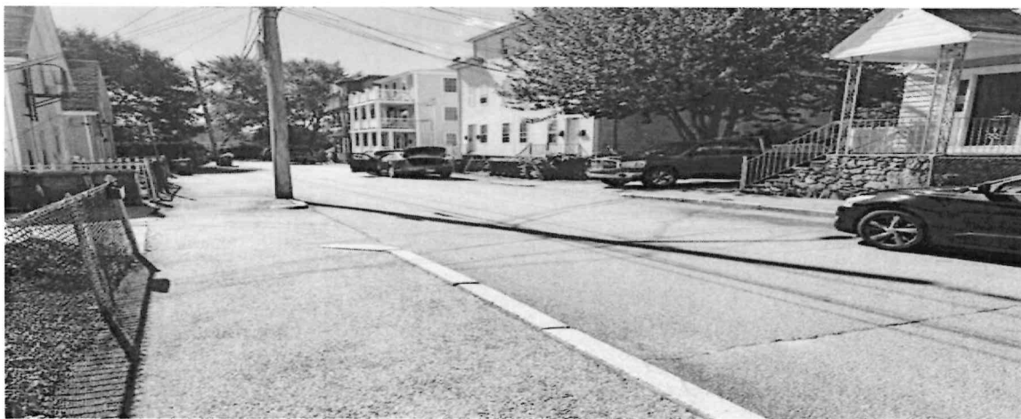
South view of street from 4 Siegel. Road width 18'6"

Steven Contente STEVEN CONTENTE Town Administrator