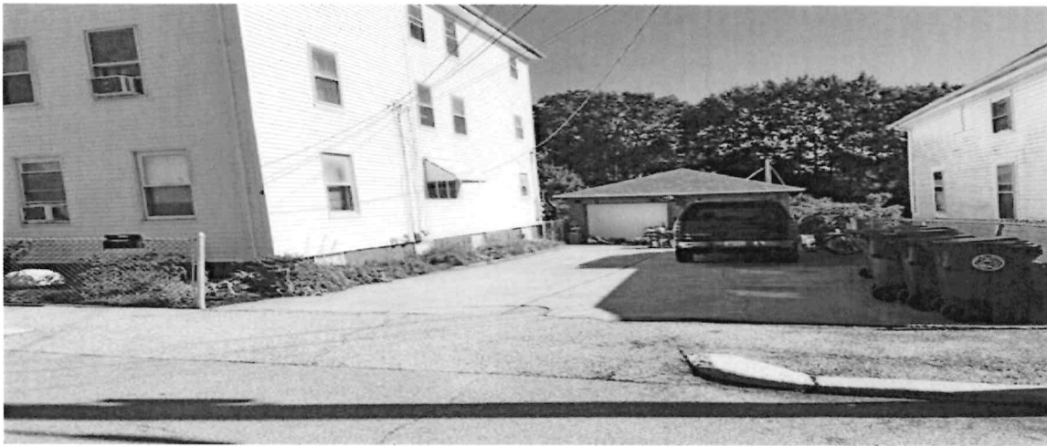
4 Siegel St. driveway has been extended; however, the curb has not been cut.

Measurements were taken for available parking on the west side of the Siegel St. from the driveway of 3 Siegel st., northbound to Mt. Hope Ave. We found that adding the 6 feet of no parking would not have a negative effect on available parking for 6 vehicles.