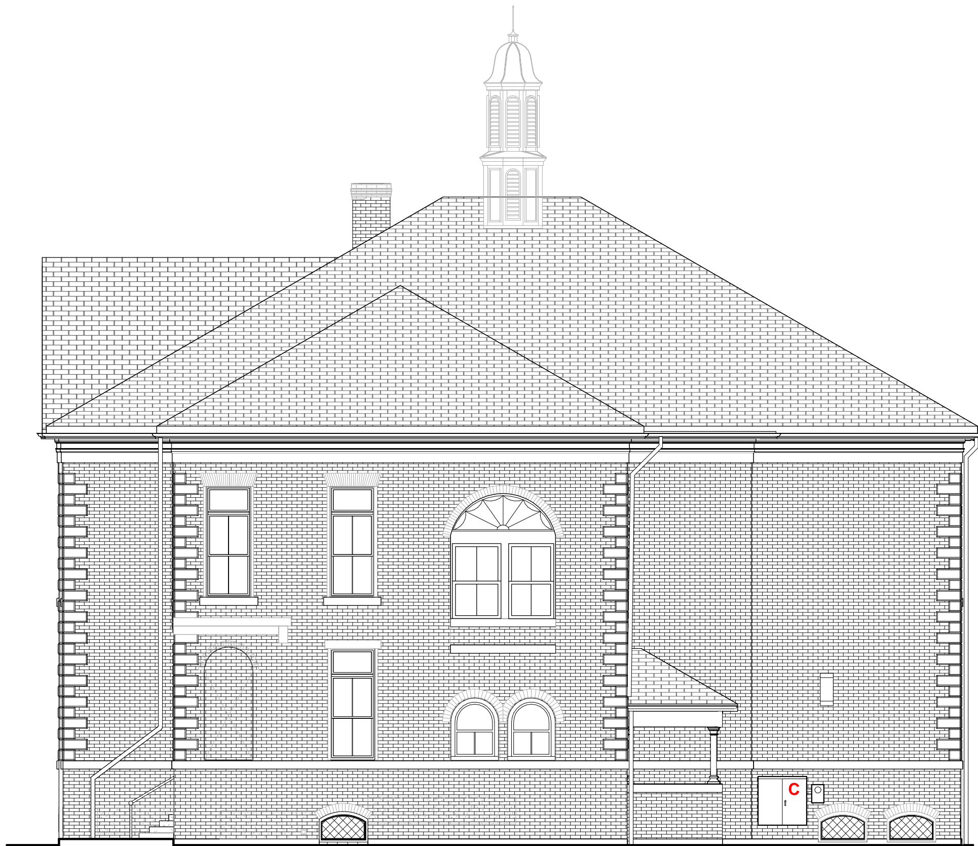
3 SOUTH ELEVATION A2.1 Scale: 1/8" = 1'-0"