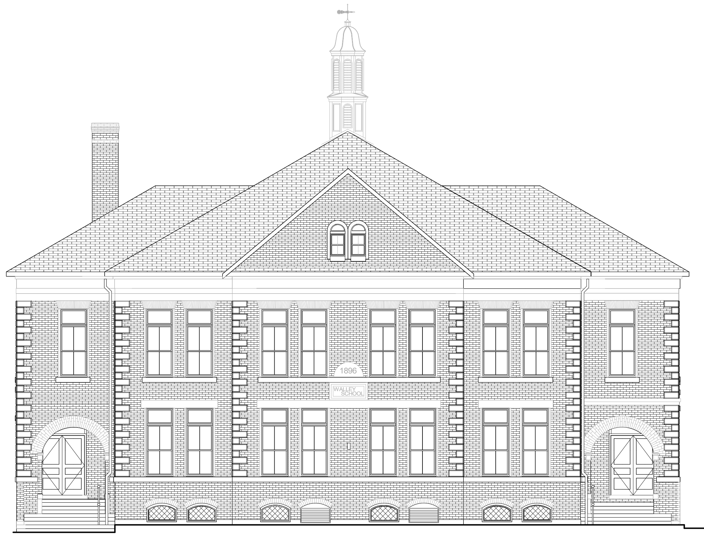
2 WEST ELEVATION A2.1 Scale: 1/8" = 1'-0"