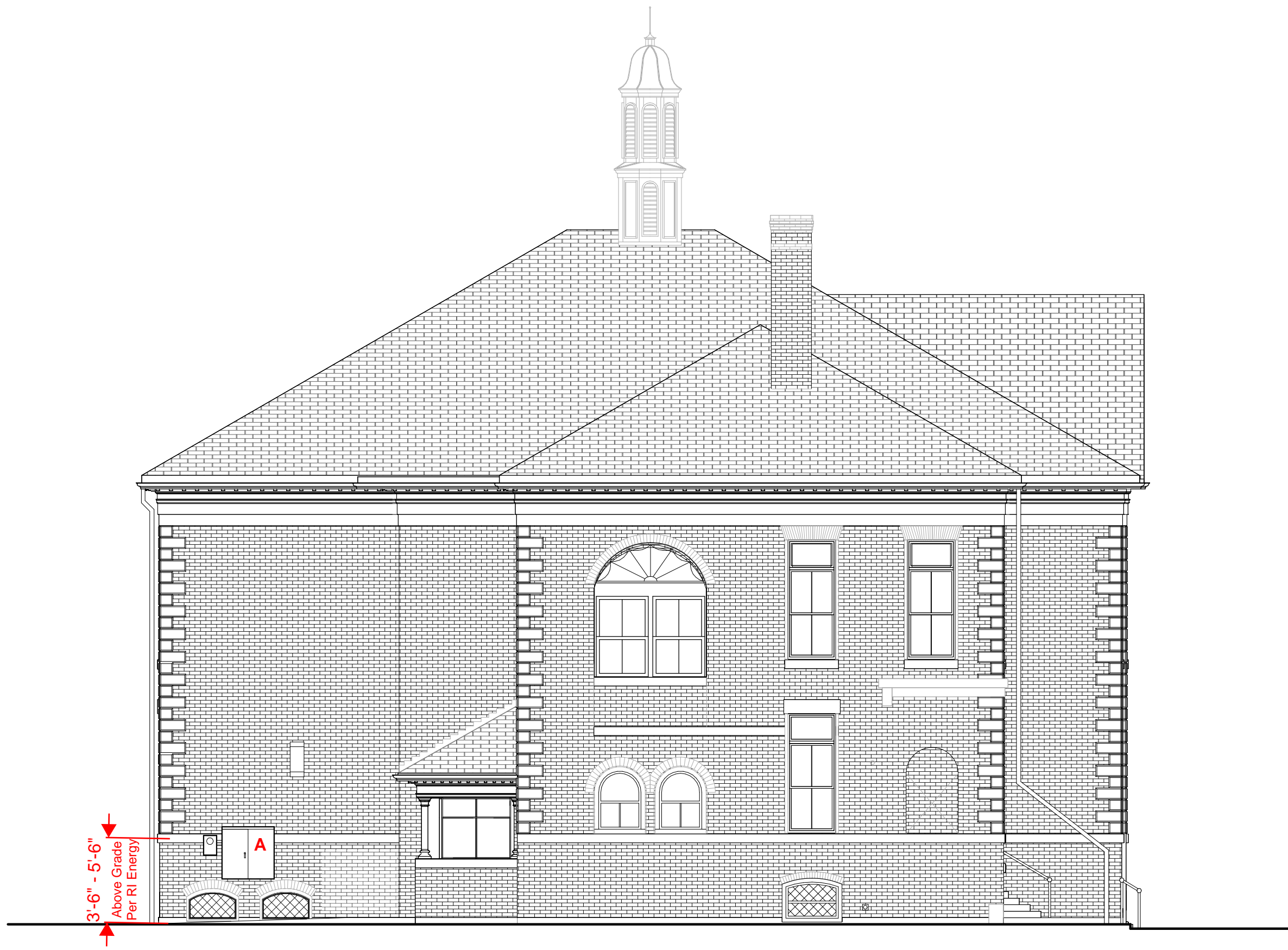
1 NORTH ELEVATION A2.1 Scale: 1/8" = 1'-0"