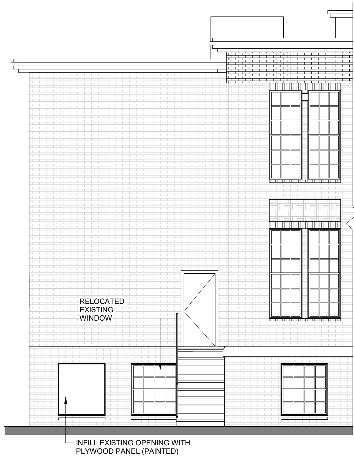
① ELEVATION - PARTIAL SOUTH 3/16" = 1'-0"