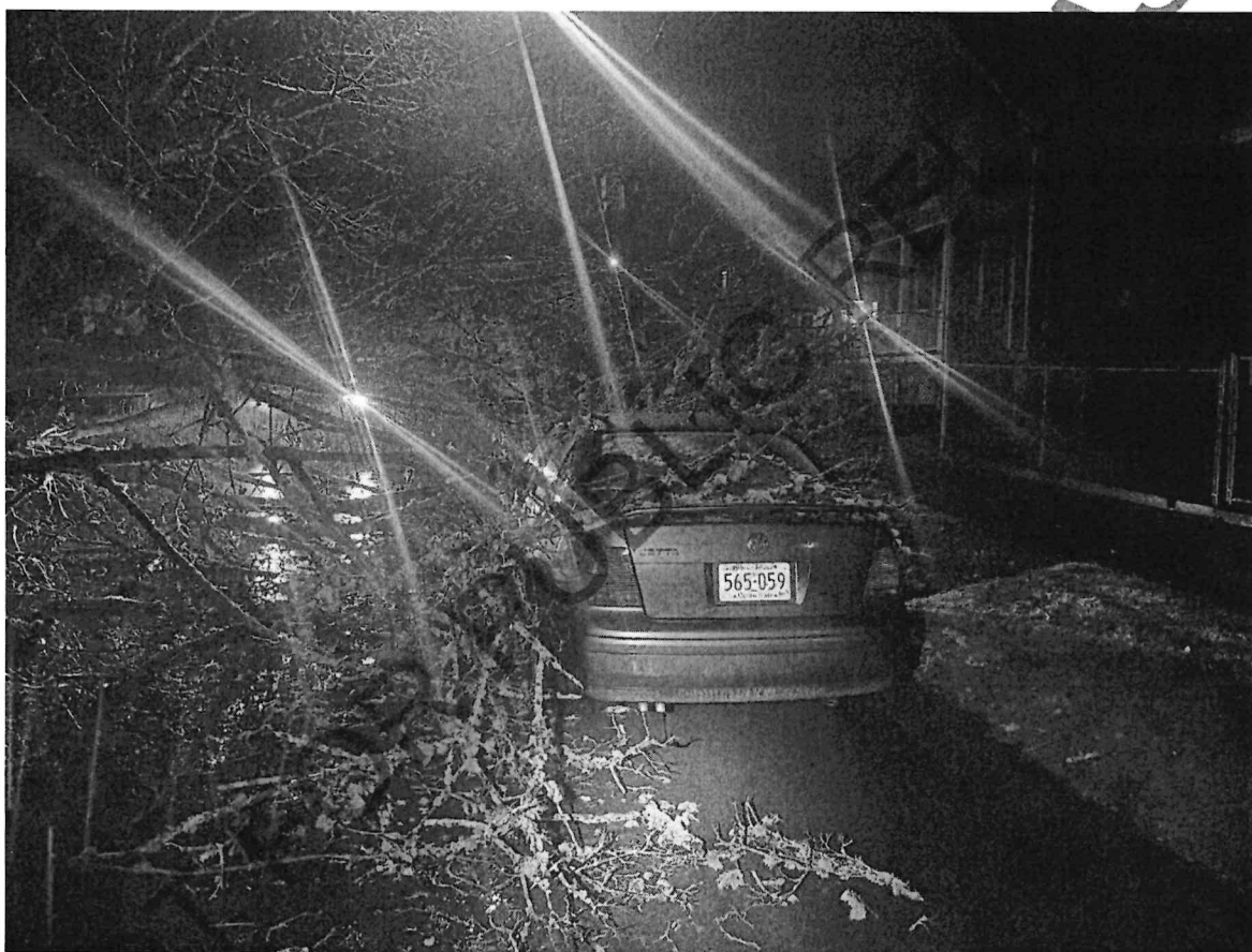
Bristol Police Department Image Associated With Case Number 23-1729-OF Image Description: Furtado's Veh