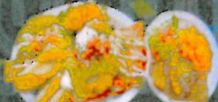
CALI SAMPLER $25.99