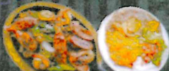
FAJITA MIX $21.99