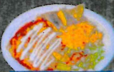
ENCHILADA COMBO $14.99