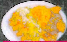
3 ROLL TACO COMBO $13.99

ALL COMBOS SERVED W/ RICE, BEANS & SALAD