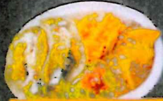
2 TACO COMBO $14.99