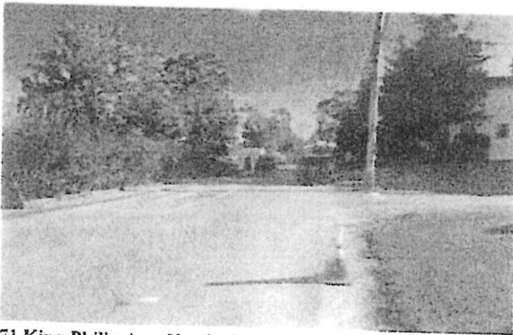
71 King Philip Ave. North view