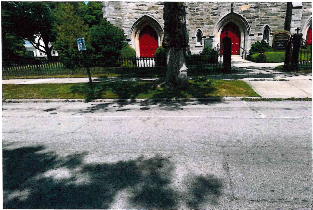
First Congregational Church-accessible parking space-North of entrance