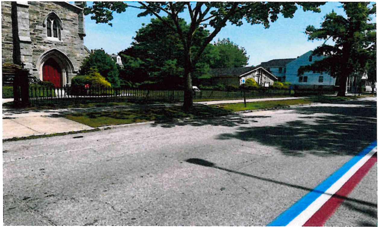
First Congregational Church-accessible parking space-South of entrance