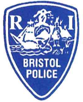
DEBORAH DASILVA Animal Control Officer

395 METACOM AVENUE ❖ BRISTOL, RHODE ISLAND 02809 TELEPHONE (401) 253-6900