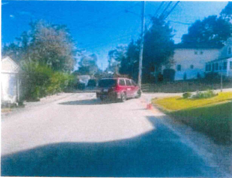
71 King Philip Ave. North view