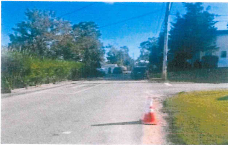
71 King Philip Ave. North view