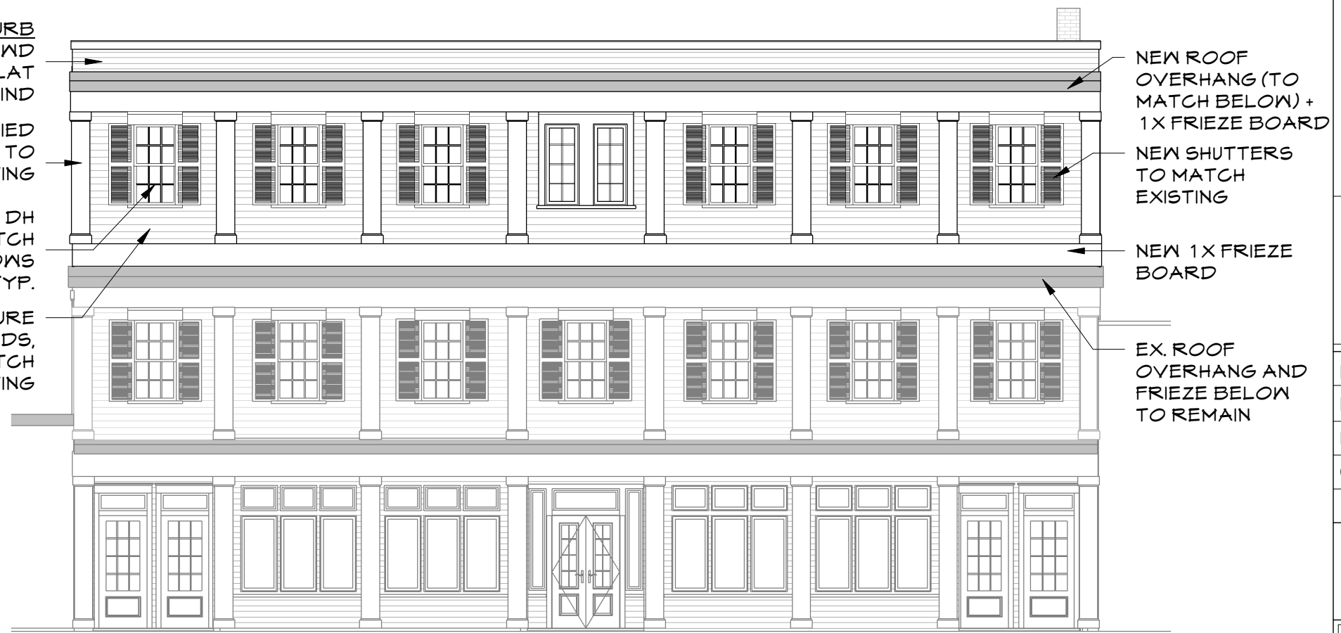
1 NEW EAST ELEVATION HDC 1/8" = 1'-0"

NEW ROOF CURB MTL. CAP, 4" EXP. WD CLAPBOARDS + FLAT MEMBRANE ROOF BEHIND NEW WOOD APPLIED COLUMN (PILASTER) TO MATCH EXISTING NEW AL. CLAD DH WINDOWS TO MATCH WIDTH OF EX. WINDOWS BELOW, TYP. NEW 4" EXPOSURE WOOD CLAPBOARDS, PTD. TO MATCH EXISTING