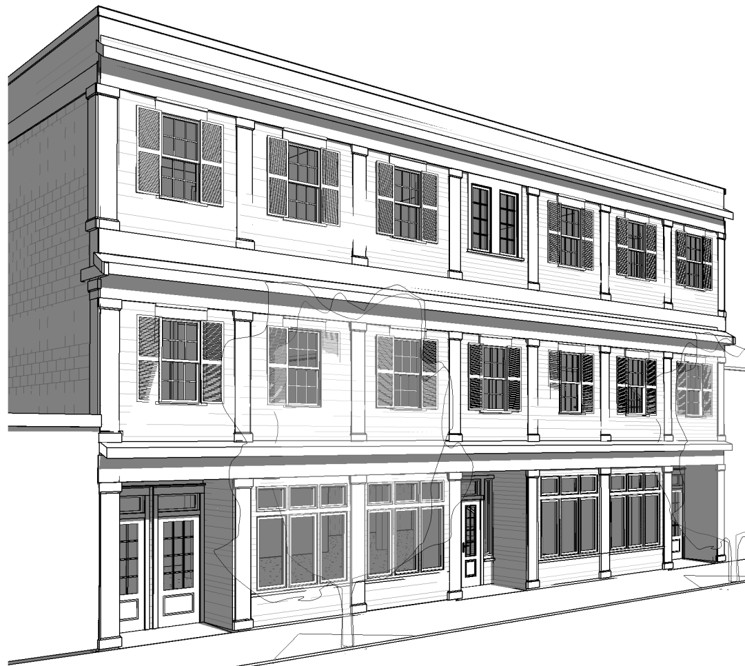
2 VIEW FROM THE SE HDC

NEW ROOF CURB MTL. CAP, 4" EXP. WD CLAPBOARDS + FLAT MEMBRANE ROOF BEHIND NEW WOOD APPLIED COLUMN (PILASTER) TO MATCH EXISTING NEW AL. CLAD DH WINDOWS TO MATCH WIDTH OF EX. WINDOWS BELOW, TYP. NEW 4" EXPOSURE WOOD CLAPBOARDS, PTD. TO MATCH EXISTING