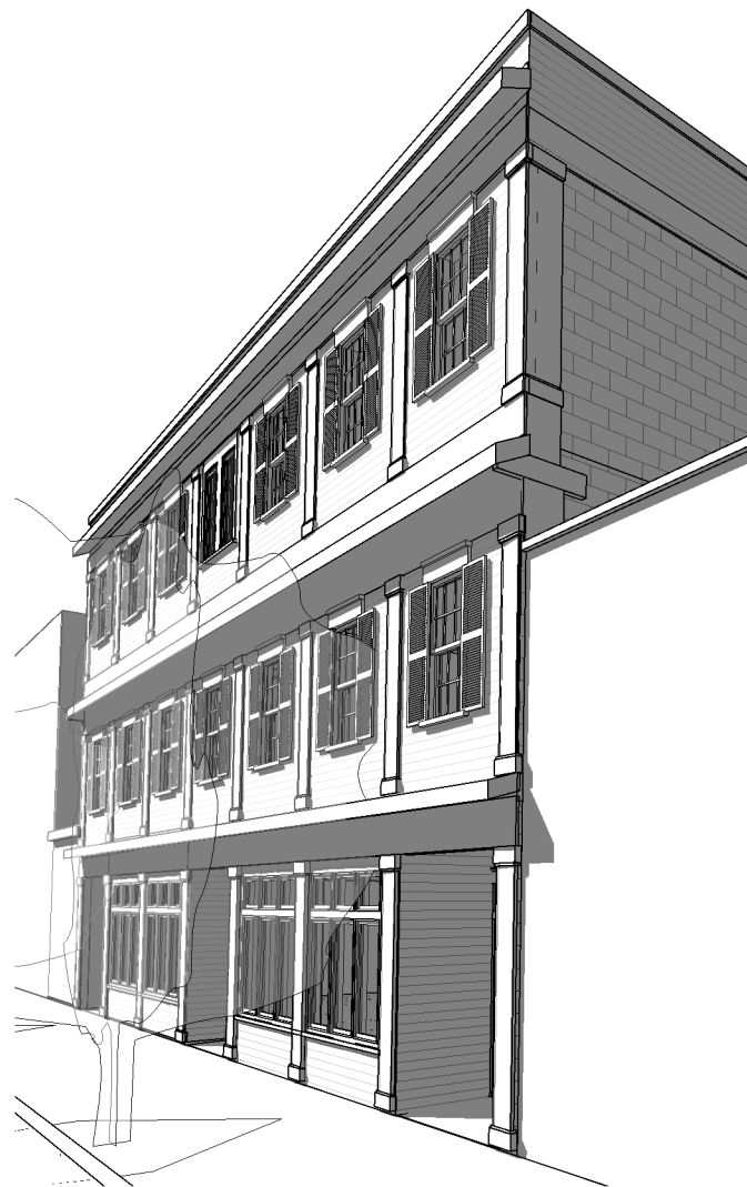
3 VIEW FROM THE NE HDC

NEW ROOF CURB MTL. CAP, 4" EXP. WD CLAPBOARDS + FLAT MEMBRANE ROOF BEHIND