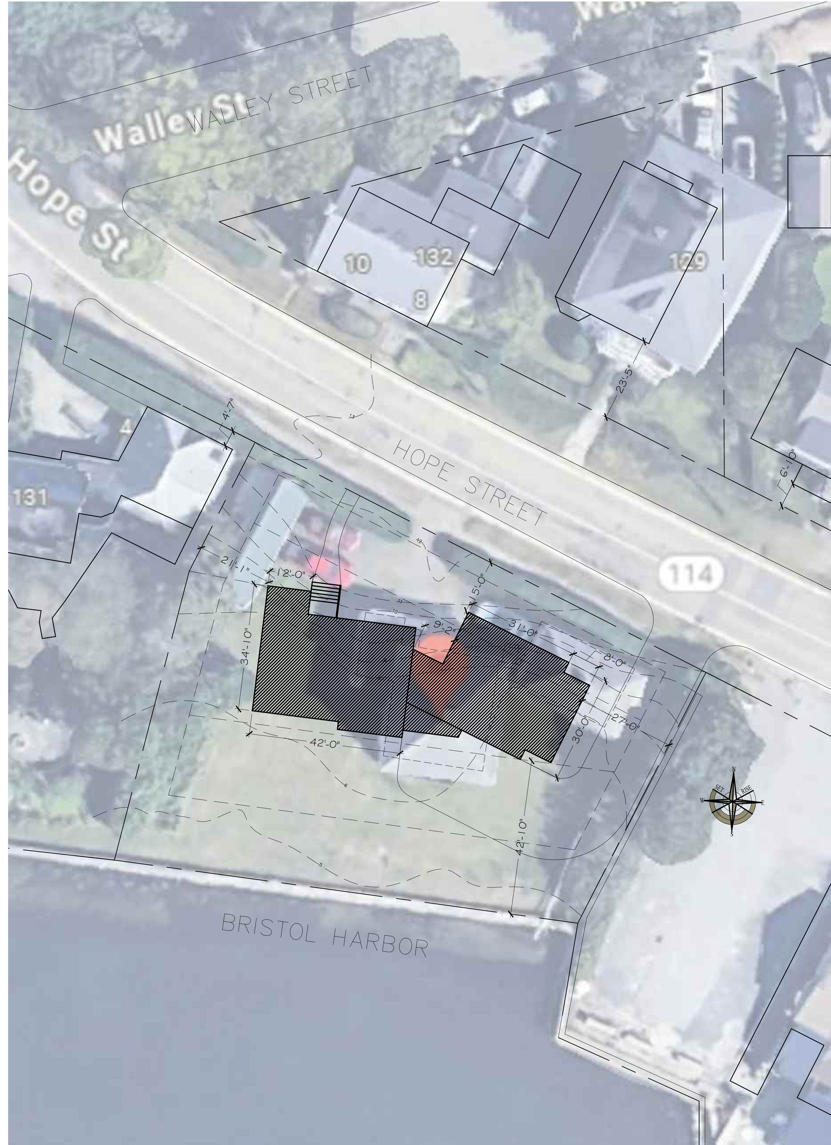
1 PROPOSED SITE PLAN A0.0 SCALE: 1/16" = 1'-0"