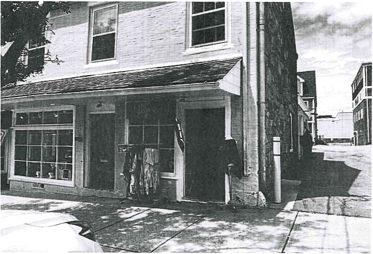
Bee Jeweled front view