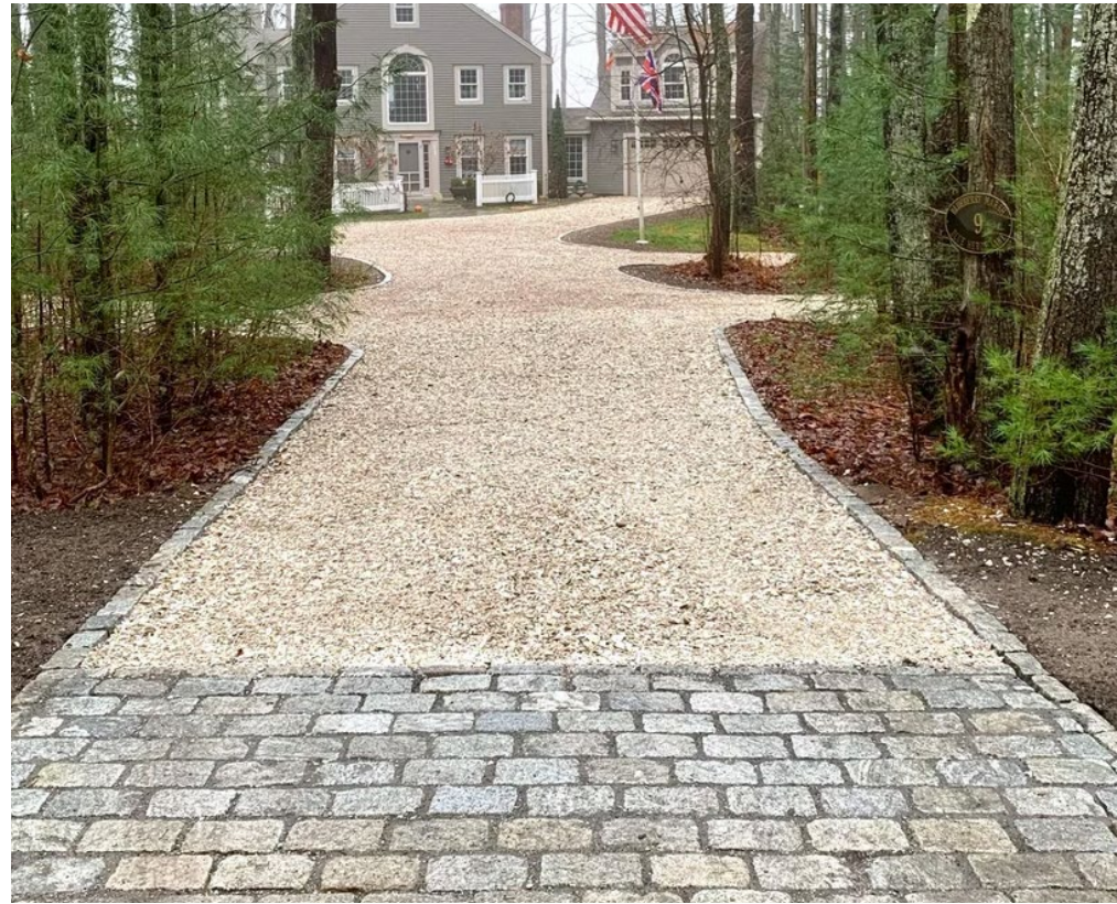
Cobble Apron & Edging