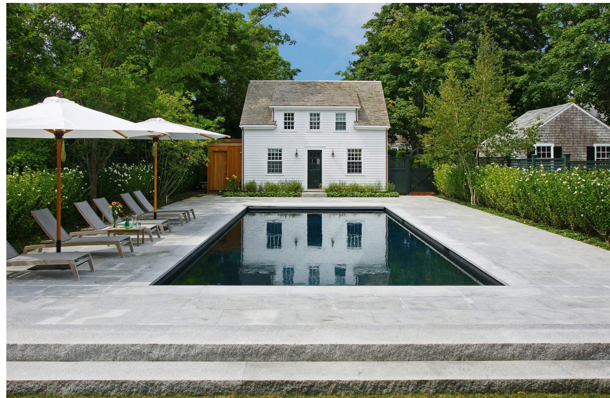
Granite Pool Deck