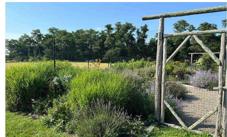
Mt Hope Farm