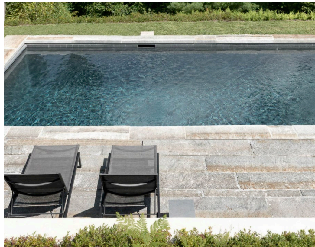
Rustic Granite Pool Deck

The outdoor grill area is still in design, but we are looking at using cabinetry under the pergola to give the area a more relaxed and comfortable feel. The pool details are still being worked out but will have a stone coping to match the terraces.