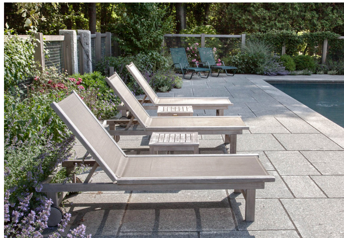
Fencing and Planting Character