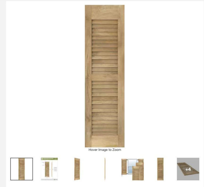
Hover Image to Zoom