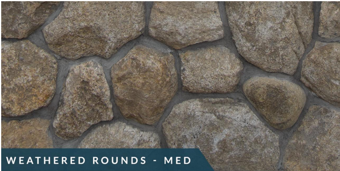
WEATHERED ROUNDS - MED