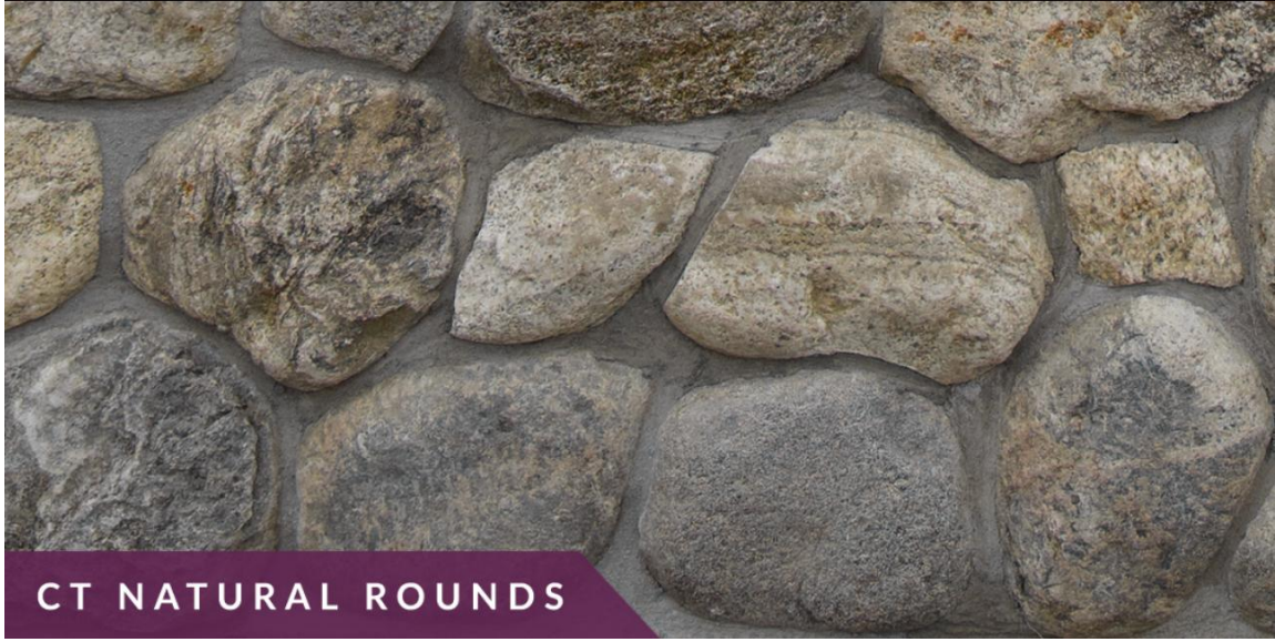
CT NATURAL ROUNDS