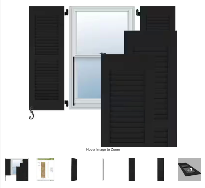
Hover Image to Zoom