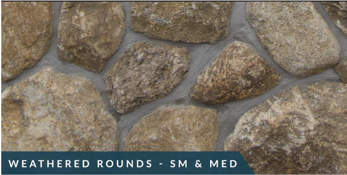
WEATHERED ROUNDS - SM & MED