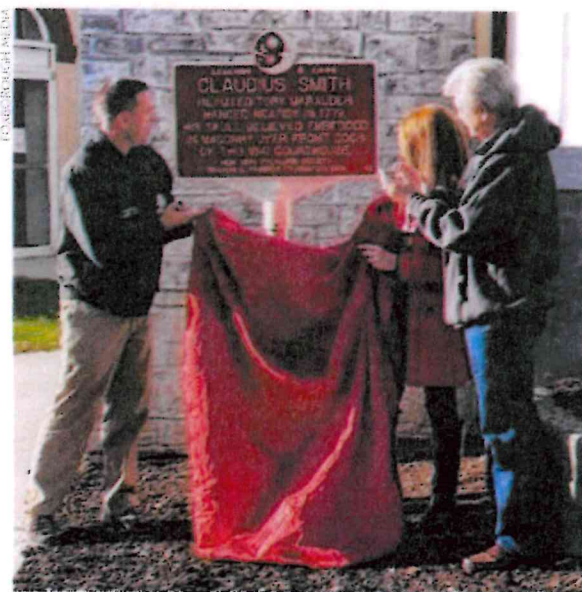
Commission projects can include researching and fundraising for new historic markers for your community.

Structure of Membership: The size of the commission can be based on a symbolic or practical number. This will differ greatly based on geographic region or density of participating institutions. Some might correlate the structure of the membership to the number of municipalities represented, or to the number of school districts. In Orange County, New York, these options would have yielded us too many members since we have 44 municipalities and 17 school districts. We chose instead to use the number 13 to symbolize the 13 colonies because it was manageable to organize that number of people into regular communication.