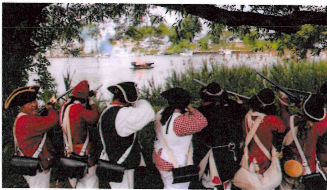
Events like reenactments can make history visible on the landscape and interest new audiences.