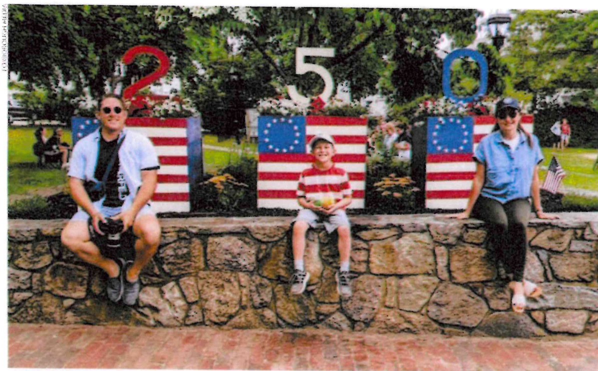
250th activities are opportunities to bring generations together (like the author and her family here) and work with local schools to create programming that meets their needs and standards.

History To-Go,” a catalog of living history professionals, their rates, and programming descriptions to make it easier for local museums, schools, and libraries to support local history professionals.