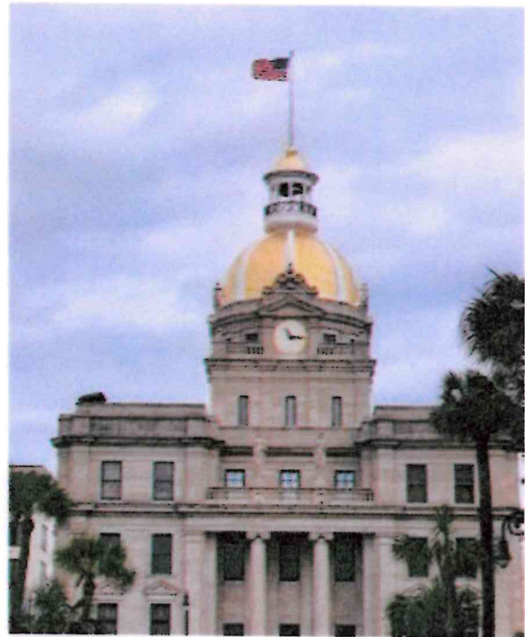
Successful commissions benefit from the involvement or support of local government.

him and he was enthusiastic to issue Executive Order No. 2 of 2019 to establish the Orange County Semiquincentennial Commission. Because Orange County is home to dozens of important Revolutionary War sites and museums such as West Point Military Academy and Washington's Headquarters in Newburgh, and because the period of significance for these places spans the full length of the war, we decided to retain the commission from the time of the order until the end of 2033.