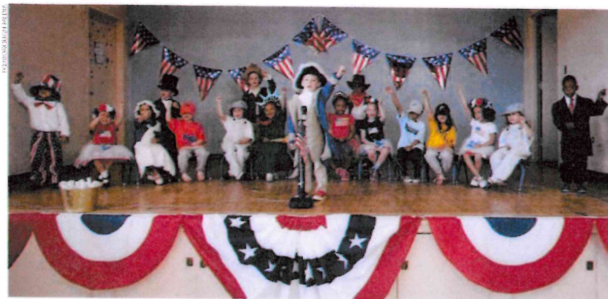
Connecting with local schools, libraries, and youth organizations is vital for bringing your 250th content and programming to young learners. From K-12 classrooms to scouting organizations and Boys & Girls Clubs, the 250th commemoration can spark lifelong interests in history and civics.