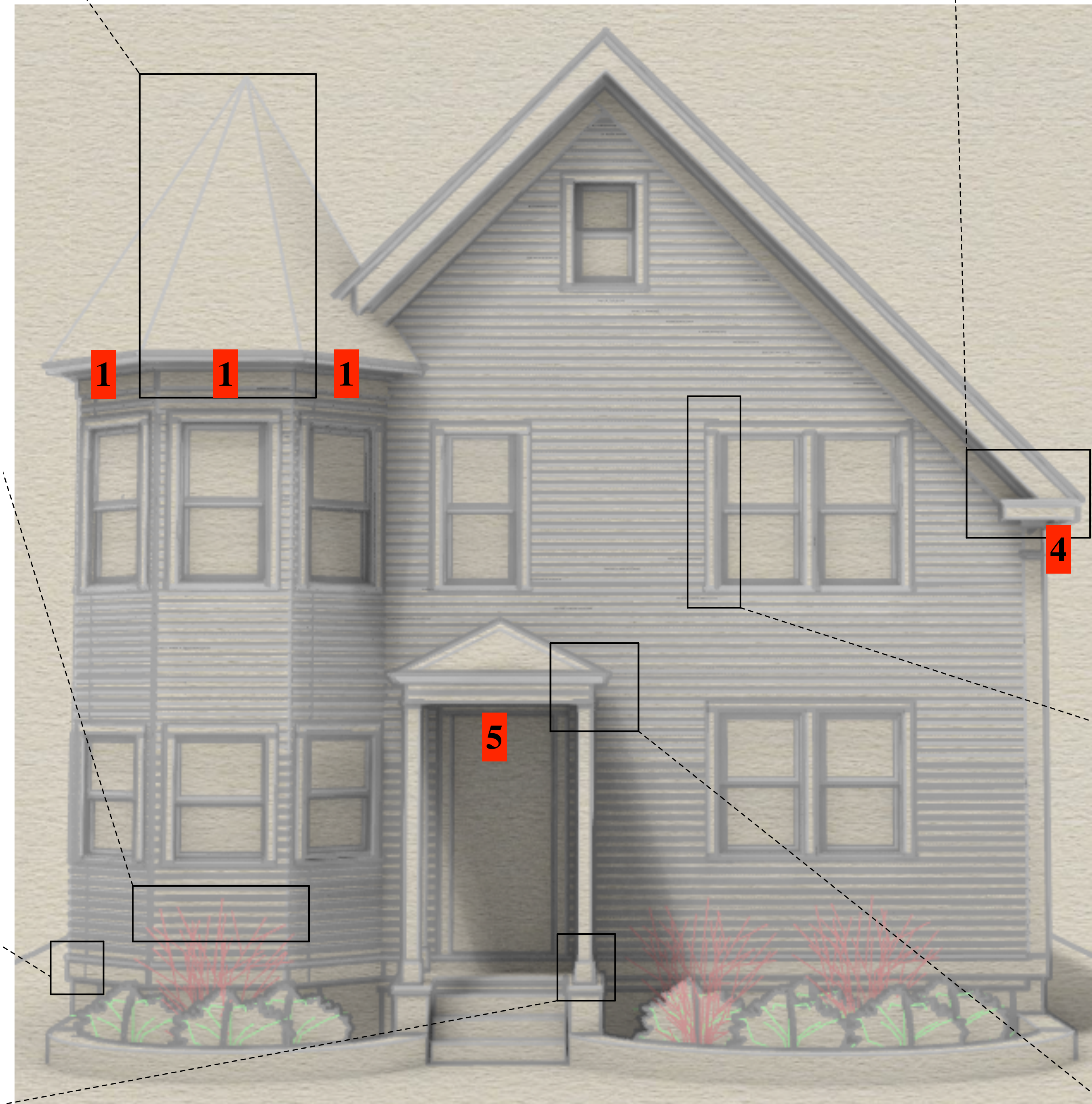
FRONT ELEVATION DETAILS- NTS.