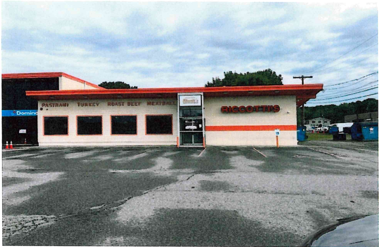
Riccotti's 11 Gooding Ave.