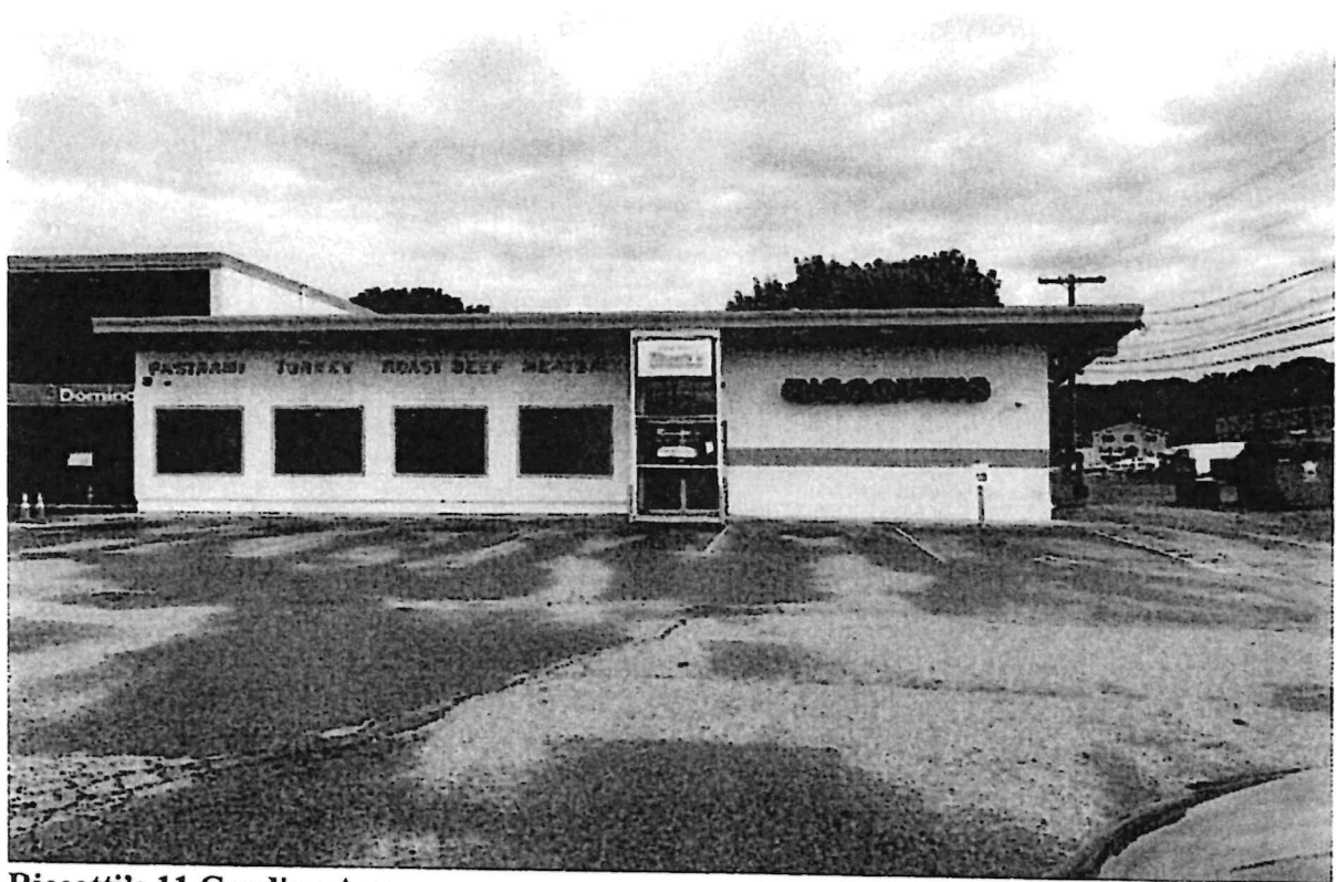
Riccotti's 11 Gooding Ave.