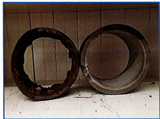
Before and after rehabilitation

The work on Maple Street involves cleaning and cement-mortar lining the interior of old cast iron water pipes. This will improve water quality and flow in the neighborhood. Fire hydrants will be replaced and some homes will also have their service lines replaced, from the water main to the property line. On Bradford Road, Maple Street and Locust Terrace, near the East Bay Bike Path, existing 2” iron mains will be replaced with a new 2” polyethylene water main.