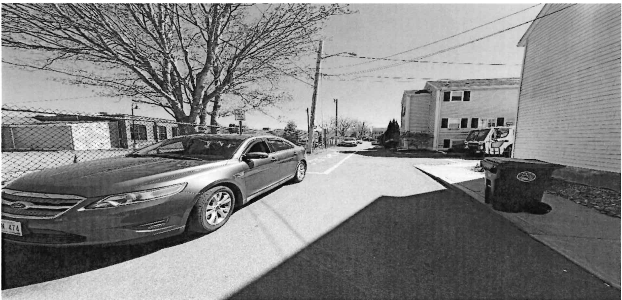
Shaws Lane at Rock Street