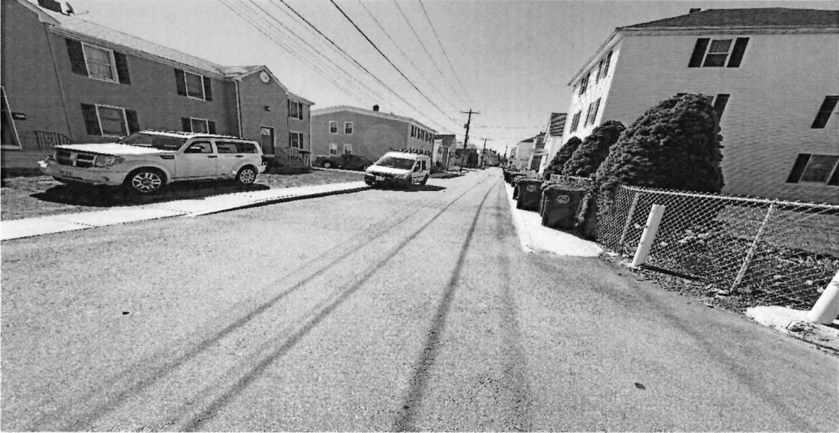
South view of Shaws Lane at Ryan Avenue