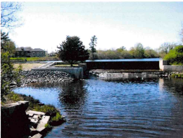
Lower Dam (Before)

Since we no longer rely upon the Kickemuit Reservoir for our water supply, we completed the removal of both the Upper and Lower Kickemuit Reservoir Dams this past year. This project, which restored the Kickemuit River as a tidal estuary as it existed over 125 years ago, was, and continues to be, widely supported by various environmental groups. We secured $4 million in grant funding to cover the costs associated with this project. Divesting ourselves from obsolete water system infrastructure removes the liability and costs for on-going maintenance.