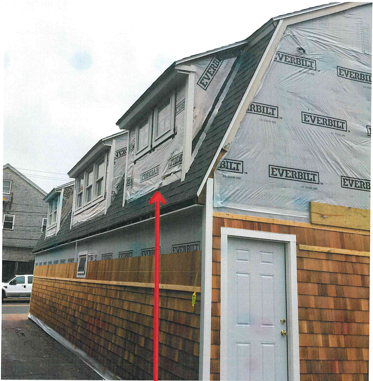
Example of south elevation dormer