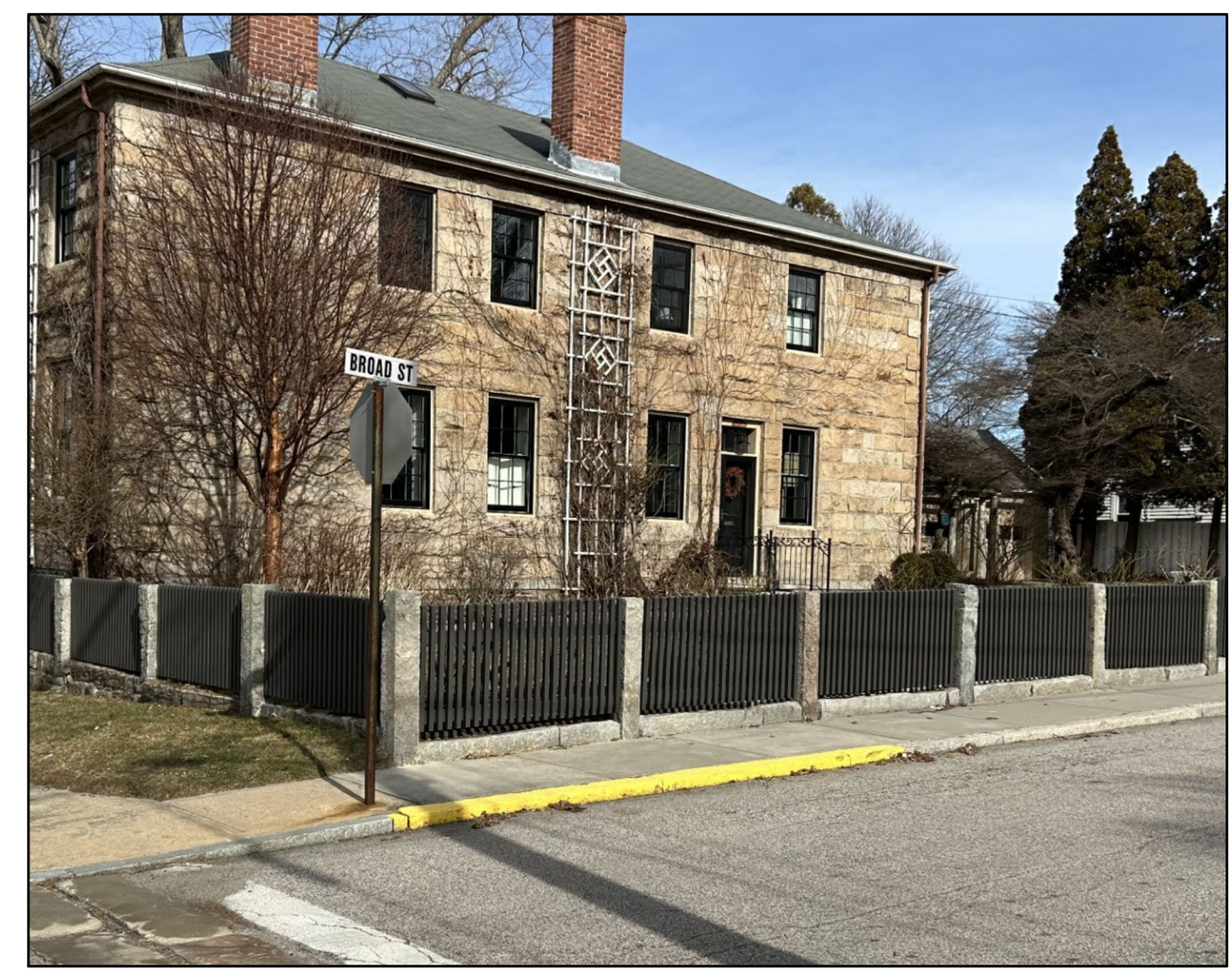
IMAGES OF FENCE SCREEN