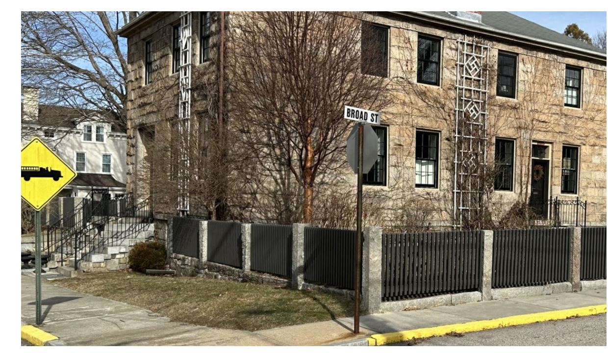
Picket fence sample in historic neighborhood designed by Walpole Woodworkers.