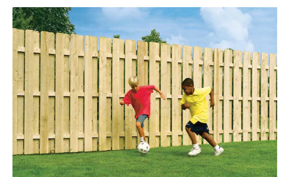
Shadowbox fence can be any height and painted any color.