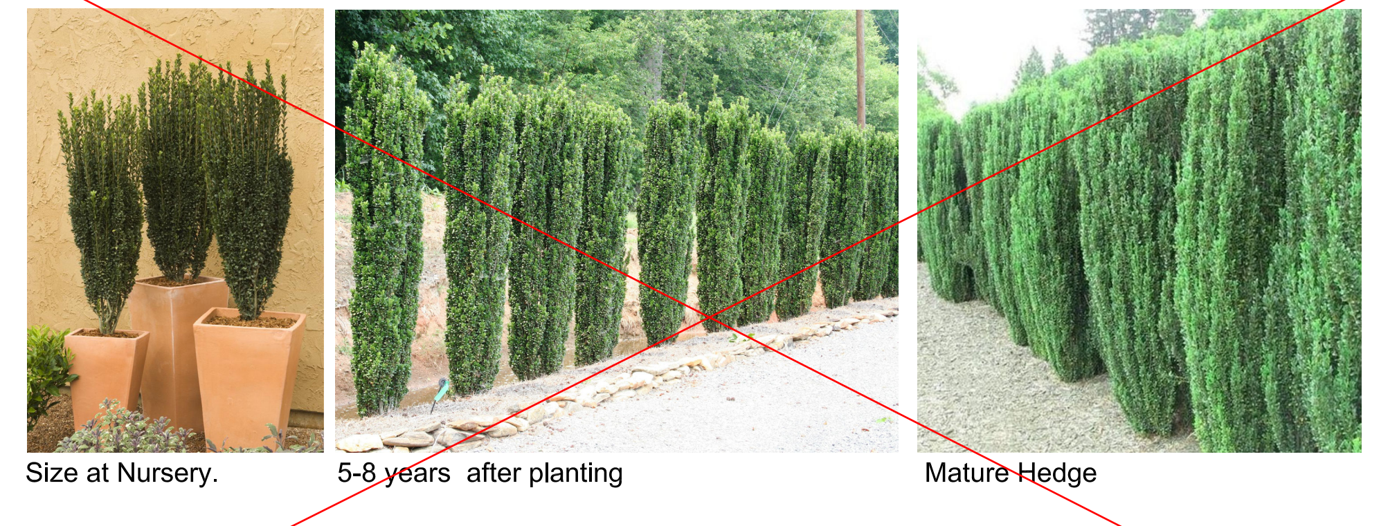
IMAGES OF TALL NARROW EVERGREEN SHRUB TO PLANT ALONG ALLEY - SKY PENCIL HOLLY THE WIDTH OF PLANTING BED IS MAXIMUM 2'-6" SO WE RECOMMEND A SHRUB THAT HAS A MATURE WIDTH OF 2'-0". SHRUB HEIGHT CAN BE PRUNED AND SHRUBS CAN BE DENSELY SPACED TO FORM A HEDGE. SHRUB IS ROAD SALT TOLERANT.