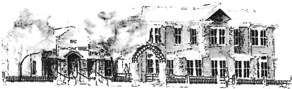
ROGERS FREE LIBRARY ADDITION

Revised 2006, Approved 2007 Revised November 2017 Approved December 2017 Revised November 2019 Approved January 2020 Revised April 2023