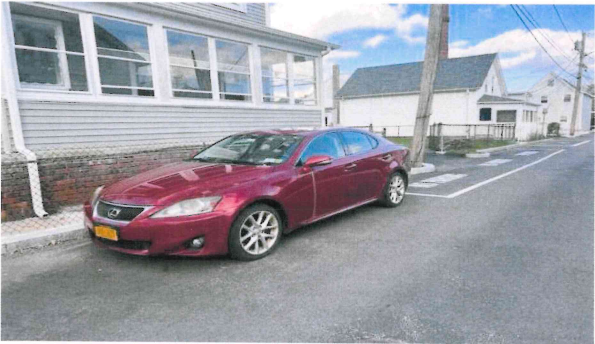
Parking space directly across from 38 Congregational St.