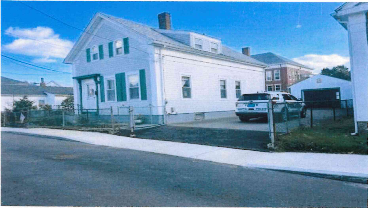
38 Congregational St.