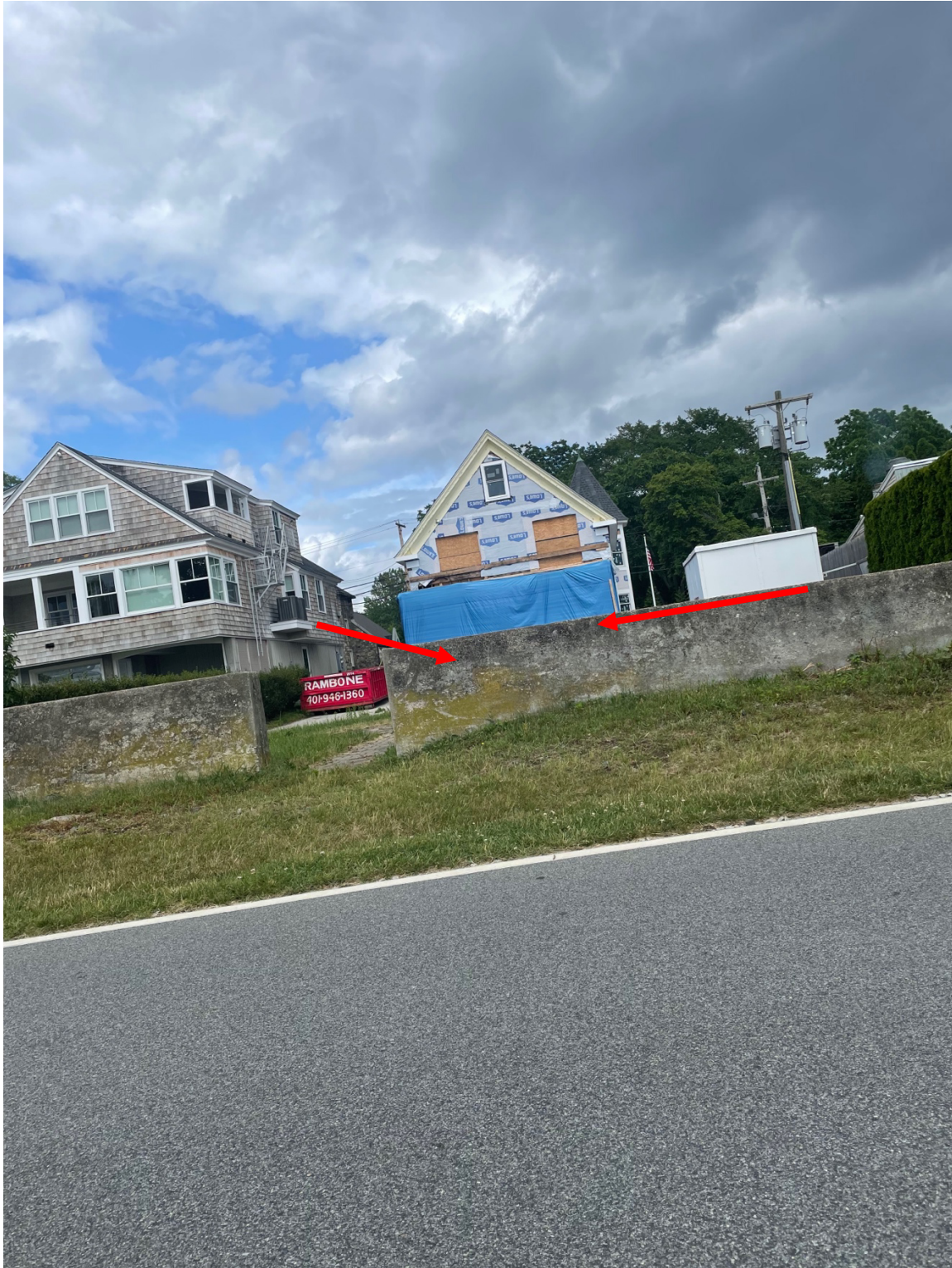
IMAGE TAKEN FROM BIKE PATH AS PICTURED, > 40' FEET AWAY. DECK HEIGHT AND MATERIAL ARE NOT DISCERNABLE OR NOTICEABLE.