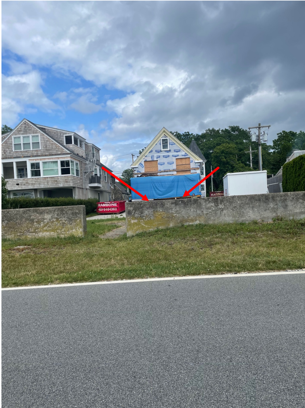
IMAGE TAKEN FROM BIKE PATH AS PICTURED, > 40' FEET AWAY. DECK HEIGHT AND MATERIAL ARE NOT DISCERNABLE OR NOTICEABLE.