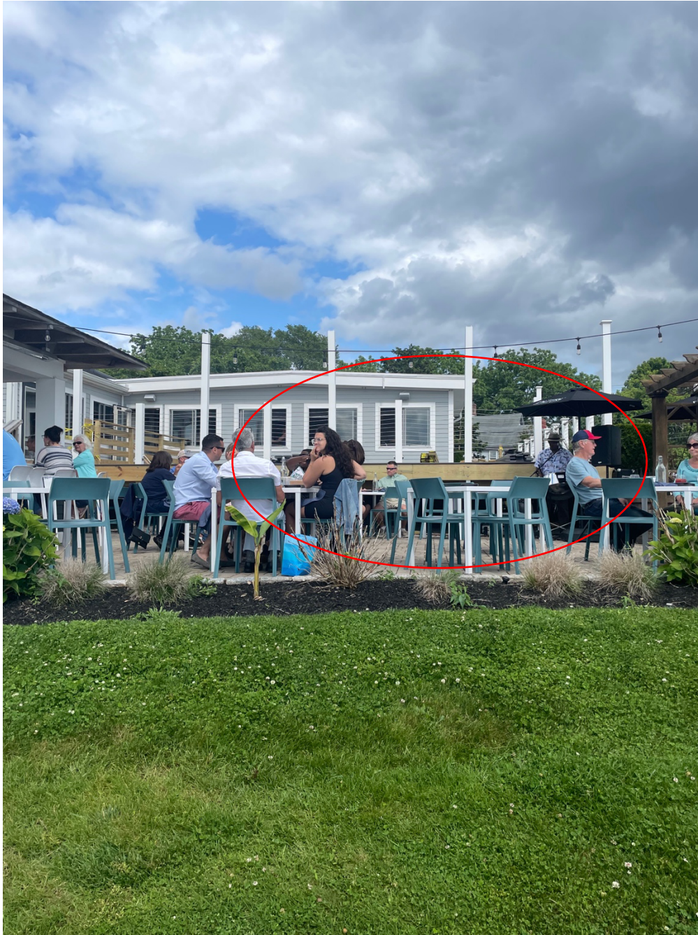
IMAGE TAKEN FROM BIKE PATH WITH NOTICEABLE CONSTRUCTION OF ADJACENT DECK, AND USAGE OF REQUESTED APPROVAL FOR SAME MATERIALS.