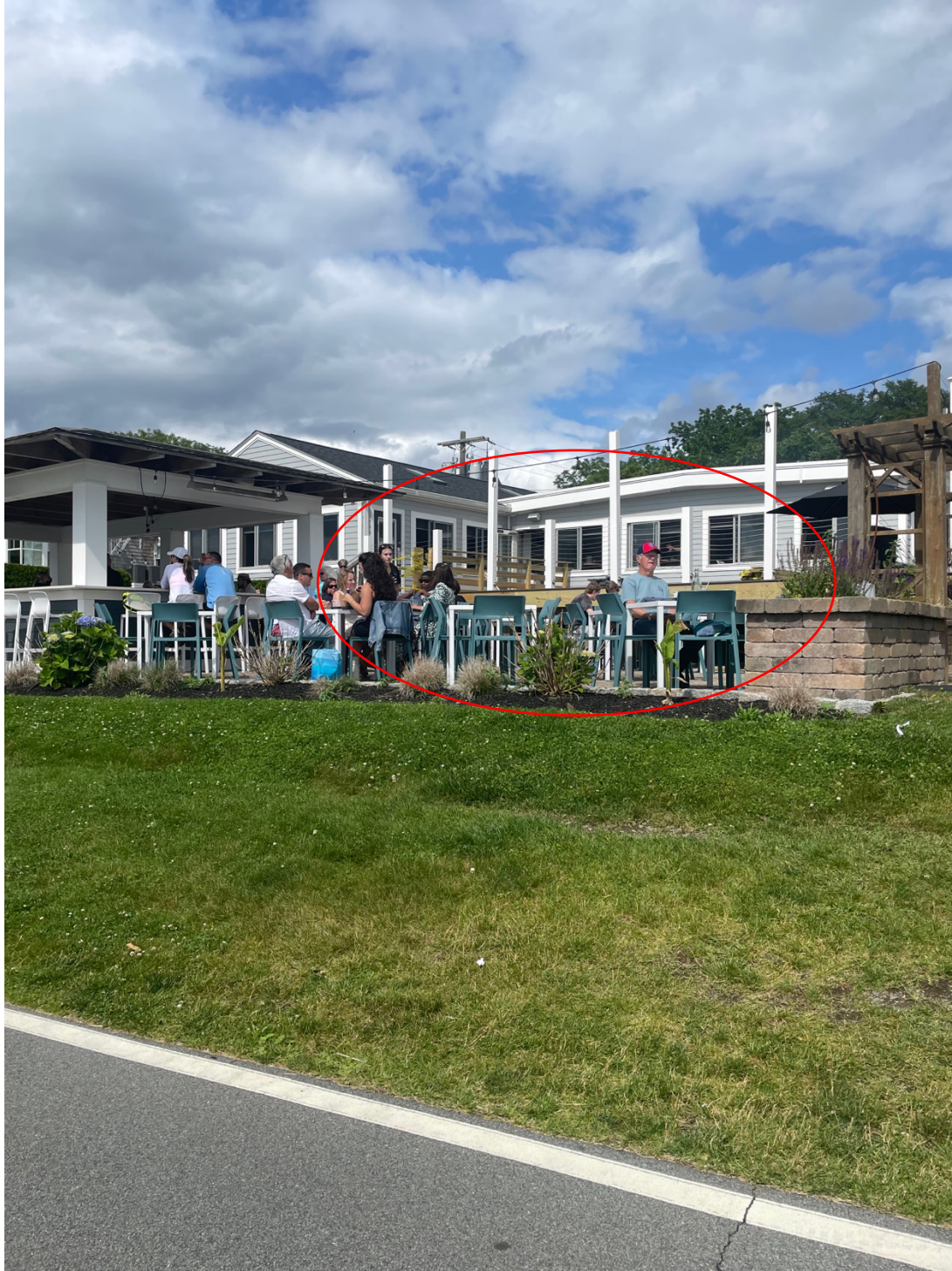
IMAGE TAKEN FROM BIKE PATH WITH NOTICEABLE CONSTRUCTION OF ADJACENT DECK, AND USAGE OF REQUESTED APPROVAL FOR SAME MATERIALS.