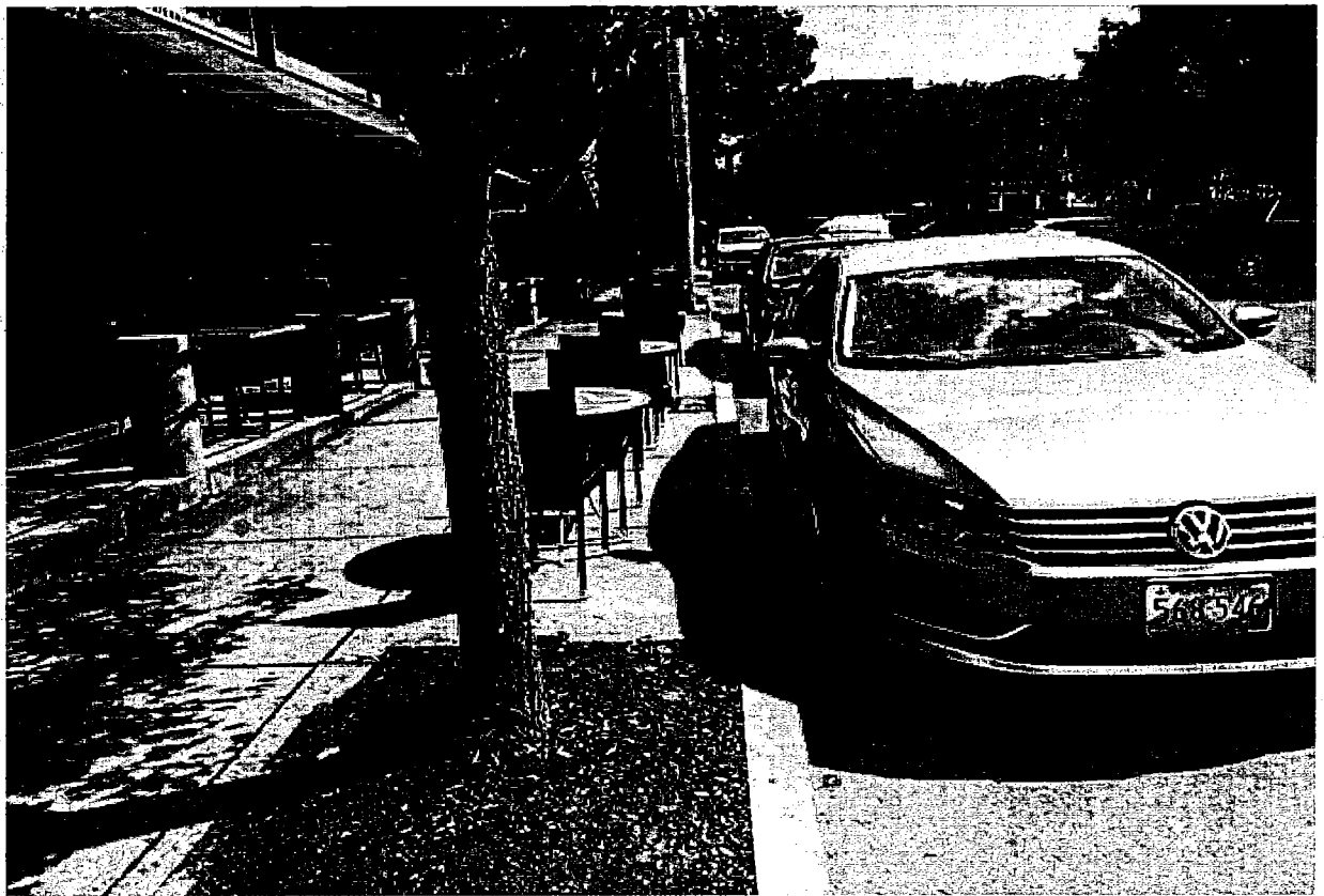
Portside Tavern-South view of sidewalk. Sidewalk width measures 9'1" and 5' at each tree location.