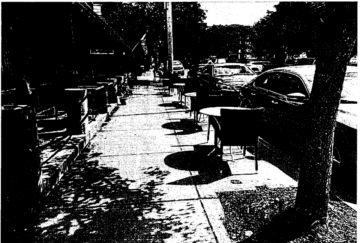
Portside Tavern-South view of sidewalk. Sidewalk width measures 9'1" and 5' at each tree location.