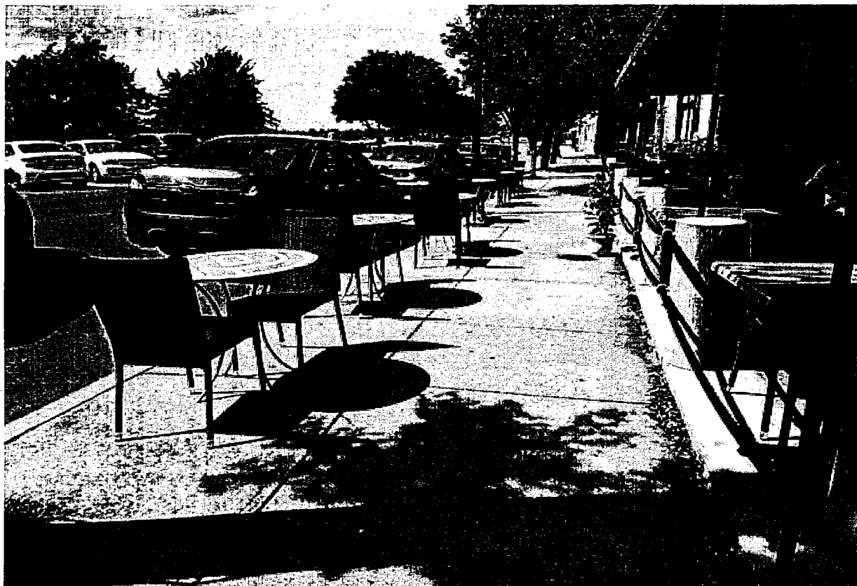
Portside Tavern- North view of sidewalk. Sidewalk width measures 9'1" and 5' at each tree location.