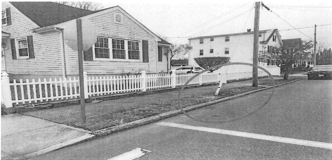
First Street proposed accessible parking space location for 212 State Street