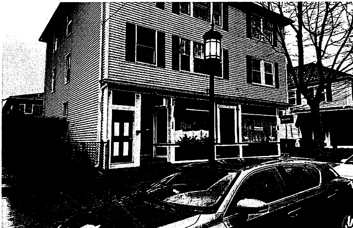
Spa No.5, 580 Wood St.