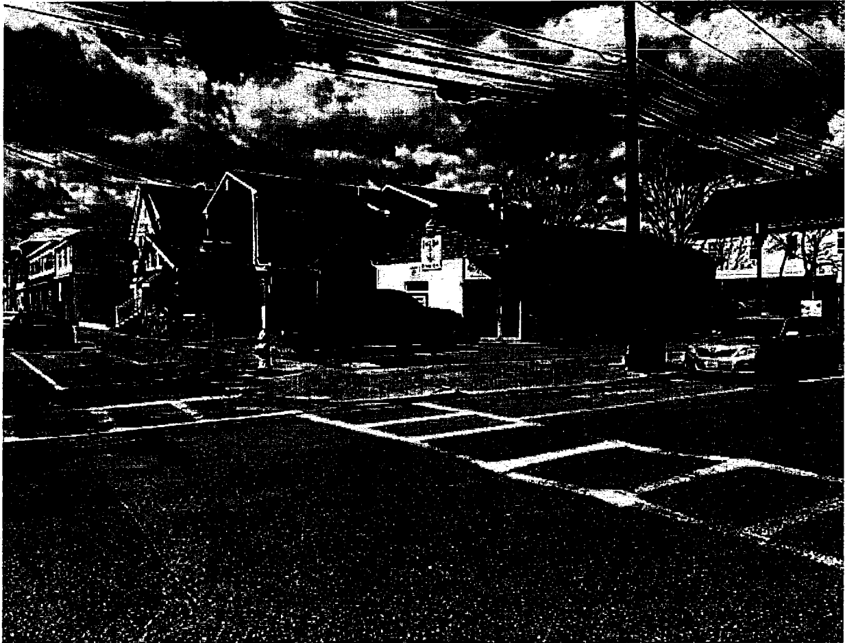
East Bay Fish Company 465 Wood St. Bristol