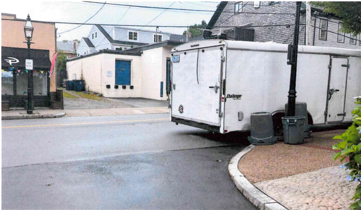
Photo taken July 2, 2025, showing conditions when trying to exit 345 Thames.