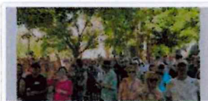
Bristol PorchFest - Home | Facebook facebook.com