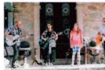
Bristol PorchFest - Home | Facebook facebook.com