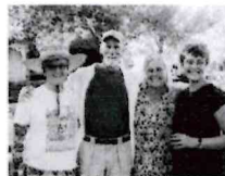
Bristol PorchFest - Home | Facebook facebook.com