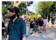
Bristol PorchFest - Home | Facebook facebook.com