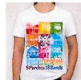
Bristol PorchFest 2019 -- Sup. customink.com