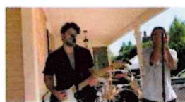
Bristol PorchFest - Home | Facebook facebook.com