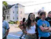
Bristol PorchFest - Home | Facebook facebook.com