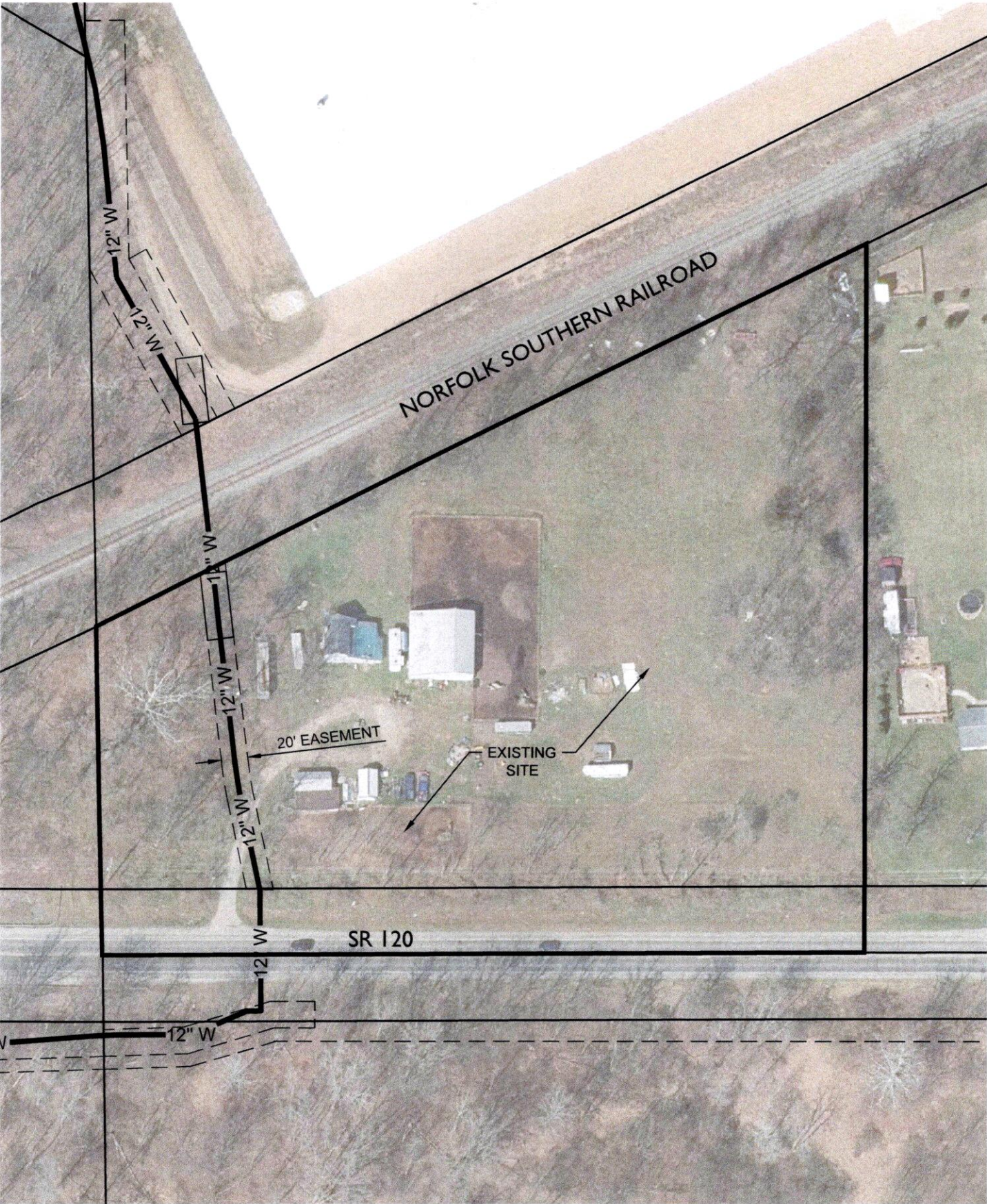
FIGURE NO. I ACQUISITION SKETCH - HELPING HANDS MINISTRIES INC © 2023 JPR - All Rights Reserved