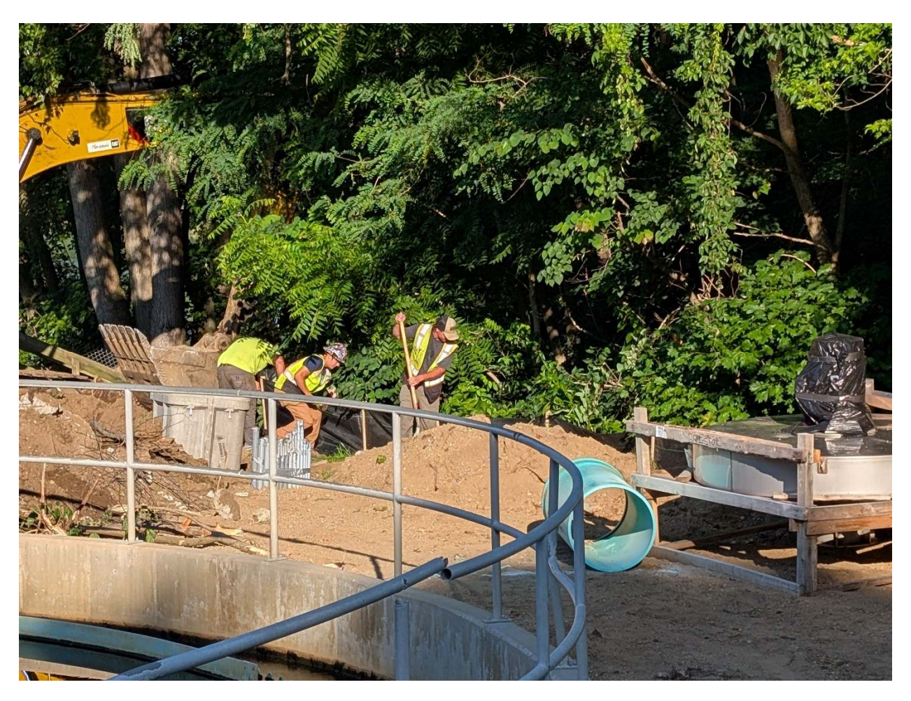
Pouring cement for treated water discharge chute