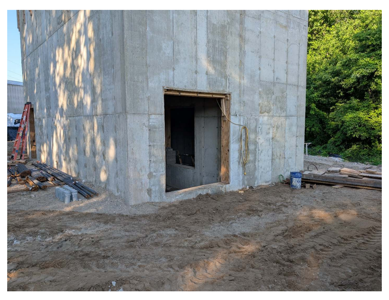
Control room door