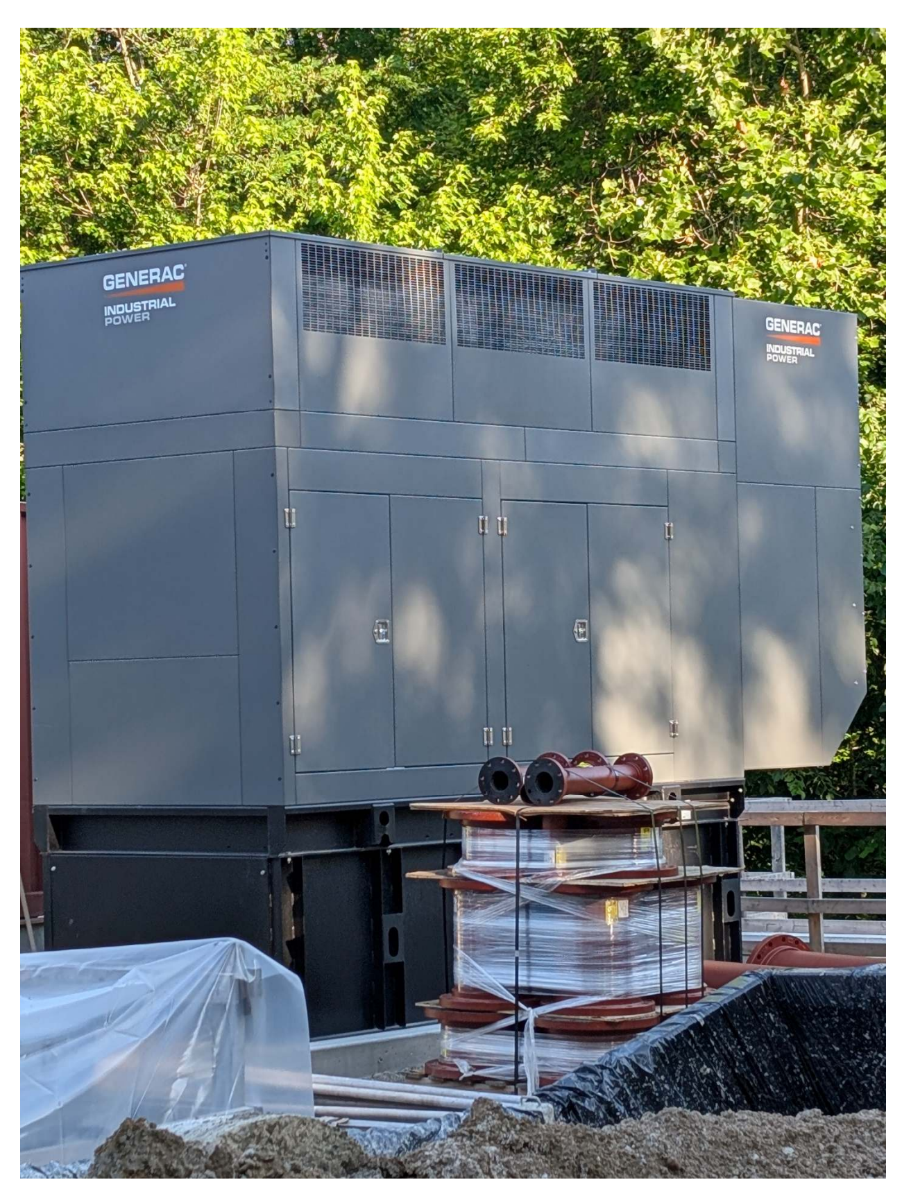
New generator weighs 12 tons