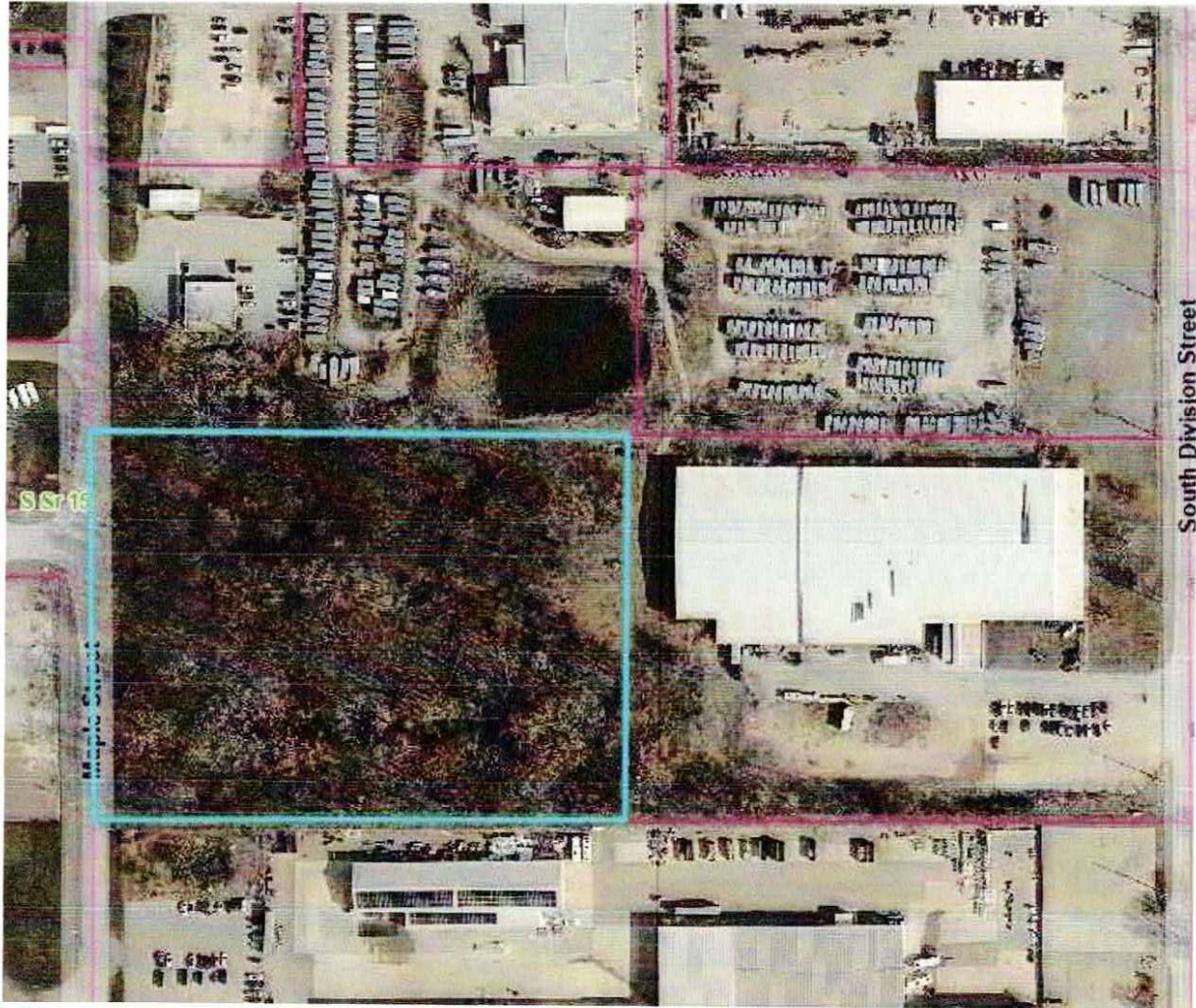
EXHIBIT B DEPICTION OF LAND